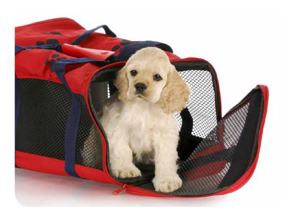
Remember to only give treats while she is in the travel bag