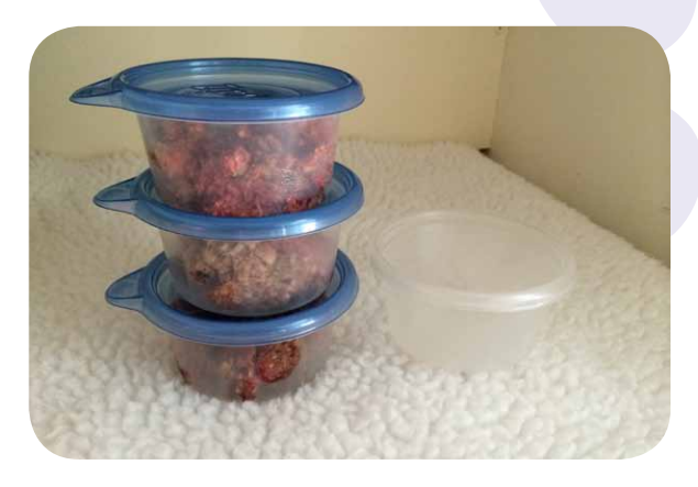
Raw food ready to travel and water dish

Keep the bag with the pup's things easily accessible as you pack the car. It's amazing how often the bag you need most winds up at the bottom of the pile if you don't plan your packing in advance.