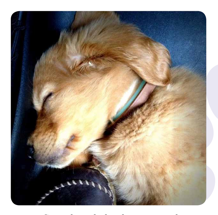
Get on the road when the puppy is tired

The car or taxi is completely packed—all you have to do it put the puppy in the car and drive away! If the puppy is settled and quiet, avoid long goodbyes and get moving right away!