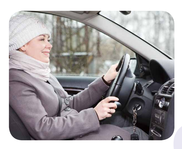
Be sure to dress warmly so you can keep the puppy comfortable

When puppies are hot you will know it because they cry, move around and cannot get comfortable. And puppies are often hot when the temperature is comfortable for us. Even if you are traveling in the dead of winter, be prepared to keep the car cool. Bring something warm to wear for each non-doggie passenger in the car and keep the temperature in the car cooler than you would probably like in order to allow your pup to be comfortable. If your puppy is crying during the trip, and you know she does not have to potty, she likely is hot.