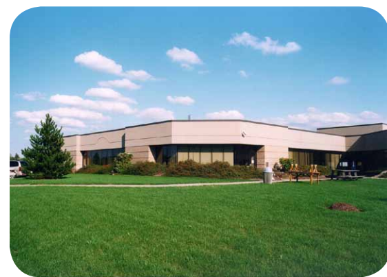
Look for a place that you would not typically find other dogs to potty your puppy