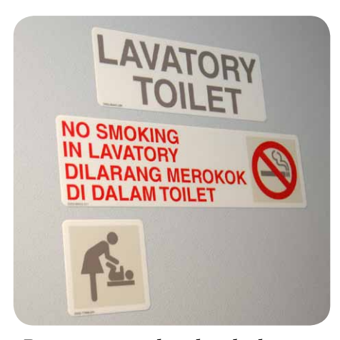
Bring your travel pack to let her potty

Once she potties, fold up the used wee-wee pad and put it in the Ziploc bag. Use the paper towels to clean up any mess. Toss them in the bag, seal it and dispose of everything in the trash container.