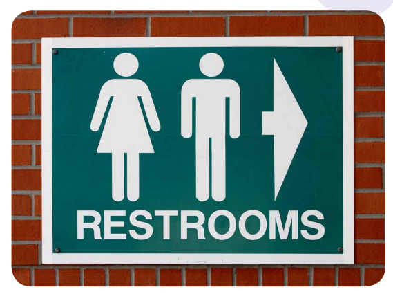
Take her to the restroom if you think she needs to potty

At security, you will have to remove your puppy so the Sherpa can be x-rayed. Then you will go to and wait at the gate until your flight is called. While moving through the airport, your pup should be in the Sherpa bag but once at the gate, you can take her out for some playtime and relaxation. Keep an eye on her in case she needs to potty. If she does, use your potty packs (see above) to keep the airport clean. It's usually best to go to the restroom to get her to potty.