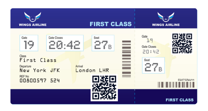
Book your flight early!

Call the airline as soon as possible to make a reservation for you and your puppy. It is best to call the airline for this reservation so you can ensure they know about your puppy and you can get the most up-to-date information on the airlines requirements for documents, travel crates, etc. Most airlines limit the number of animals allowed on each flight to be sure to book your flight early if you have a small window of travel available.