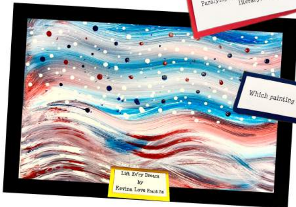
Lift Every Dream by Kevena Love Franklin

"Olympics and Paralympic Day" in Henry County is hosted through the Georgia Amateur Boxing Association. The United States Olympic and Paralympic Committee recognizes the event as an official as an official World Olympic Day event promoting the Olympic ideals of Fair Play, Perseverance, Respect, and Sportsmanship through fitness and educational fun. Celebrated by millions of people in more than 160 countries to commemorate the birth of the modern Olympic Games, Olympic and Paralympic Day is not only a celebration but an international effort where communities across the United States celebrate through with the Henry County Public Library System. Through partnering with the Henry County Public Library System - Fairview Public Library, we are excited to share the Olympic and Paralympic-inspired art in a public exhibit promoting reading, children's literacy, and an unbreakable champion's spirit!