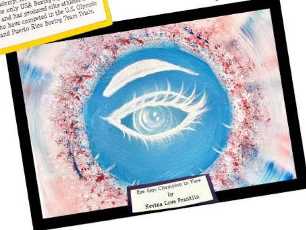
Eye Spy: Champion in View by Kevena Love Franklin