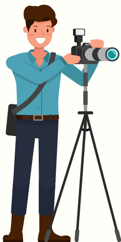
Photo Day is Sunday, February 23rd for all groups, except Spadok, from 2:00 pm onwards at Holy Family Church. Exact schedule will be sent out soon, please watch your inbox. Please view Photo day files at this link to prepare for photo day.

EVERY dancer must have a form printed and completed to hand in on photo day. EVERY dancer is photographed. Sibling/Family photos will only be done during the youngest dancer's time slot (except for Siblings/Family members of Spadok dancers which will be done in March).