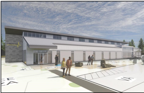
Architectural rendering of our new 911 Center

Cowlitz 911 is in the later stages of the construction process of building a new 911 Communications Center, with a project budget of approximately $16 million. The Executive Director will be expected to be the owner representative, and in close coordination with the Project Manager, lead this project to completion. The Executive Director will coordinate a seamless relocation into our new center. The transition to the new 911 Center is scheduled for the second quarter of 2022.