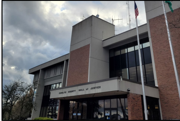
Currently housed in the Hall of Justice in Kelso, WA

The Cowlitz County 911 Center serves as the primary Public Safety Answering Point (PSAP) for a combination of thirteen (13) law enforcement, fire and medical response agencies in Cowlitz County. The organization covers over 1,166 square miles and serves a population of 111,800 citizens. The organization answers an average of 210 emergency 911 calls and 400 business calls per day.