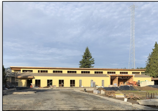
Construction progress as of November 2021