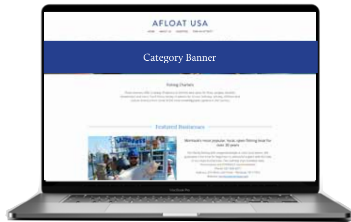
Category Banner $300/mo 1920px x 100px