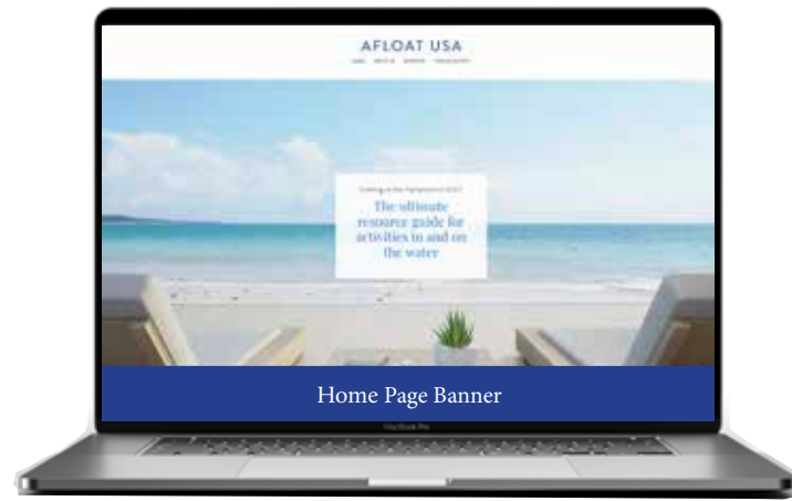
Home Page Banner $500/mo 1920px x 100px