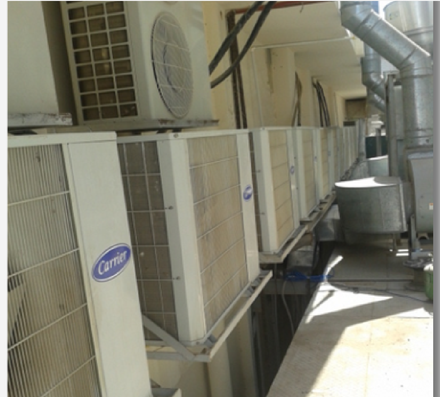
GAD RESTAURANT, HERA'A STREET, JEDDAH, KINGDOM OF SAUDI ARABIA Supply and installation of HVAC system