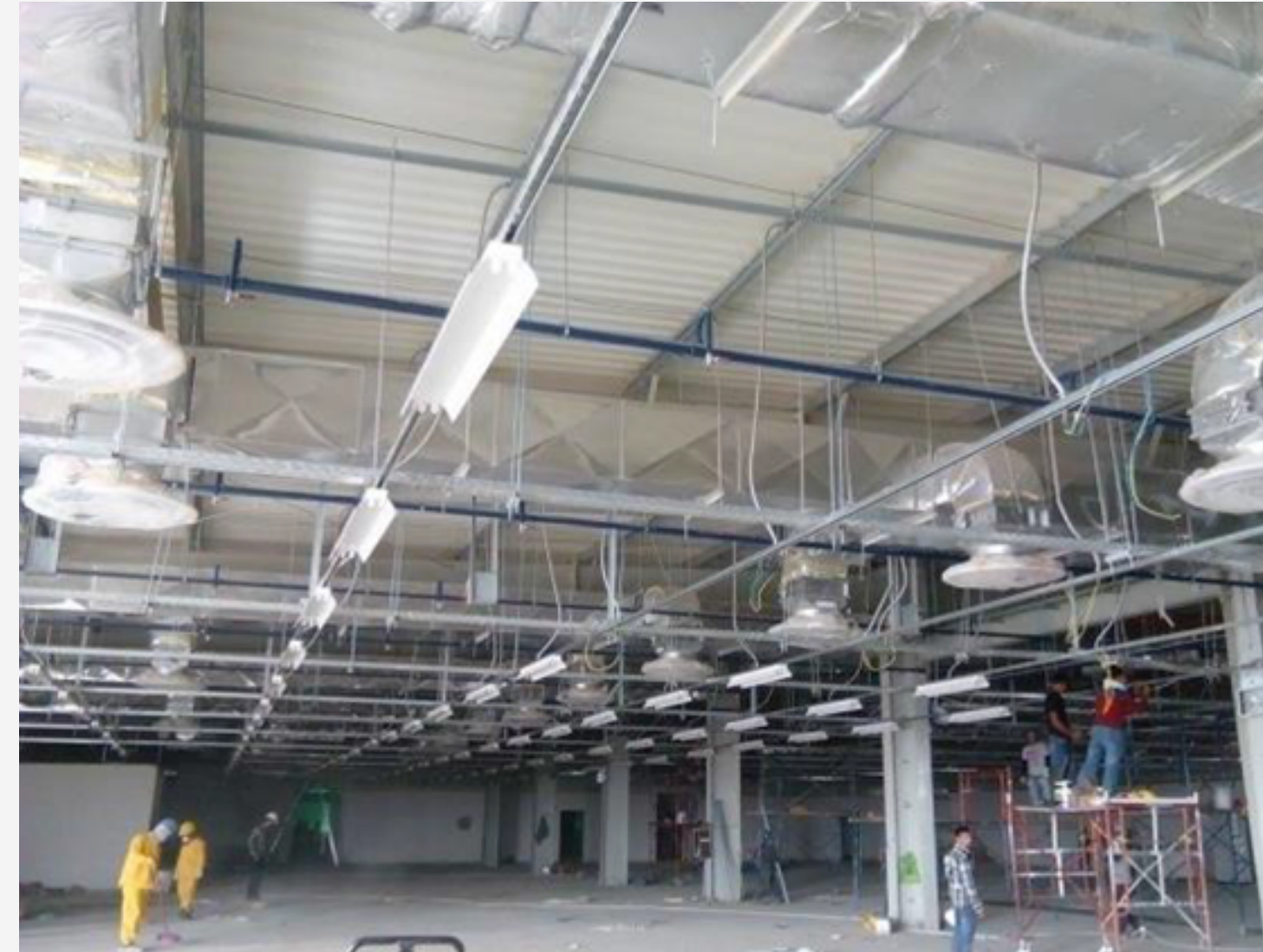
RED SEA MALL AREA, JEDDAH, KSA Cable tray fixing and electrical wiring installation