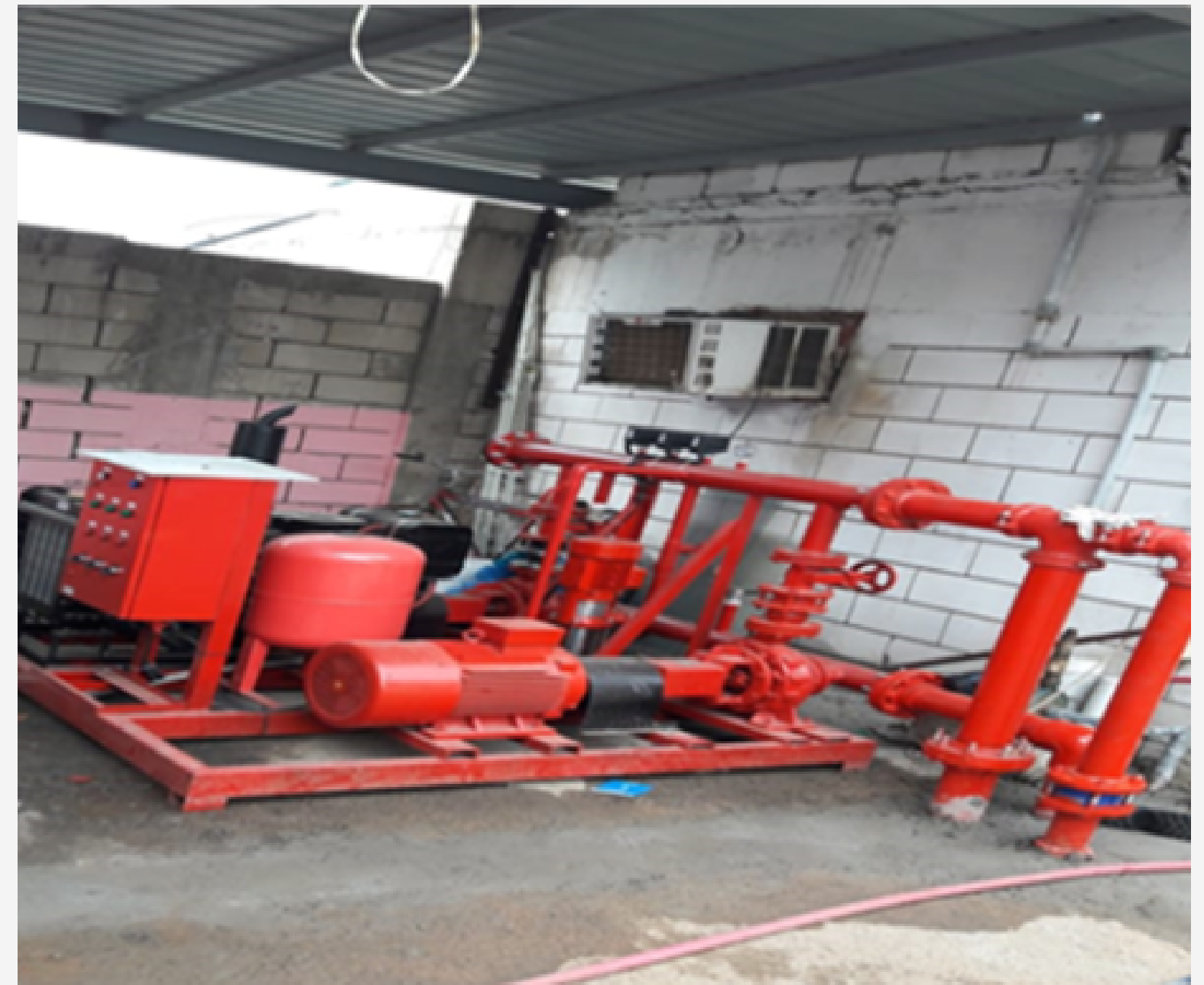
AL KHATANNI CURTAIN FACTORY, SHOWROOM & ADMIN. OFFICE, Jeddah Installation, Testing & Commissioning of Fire Fighting System