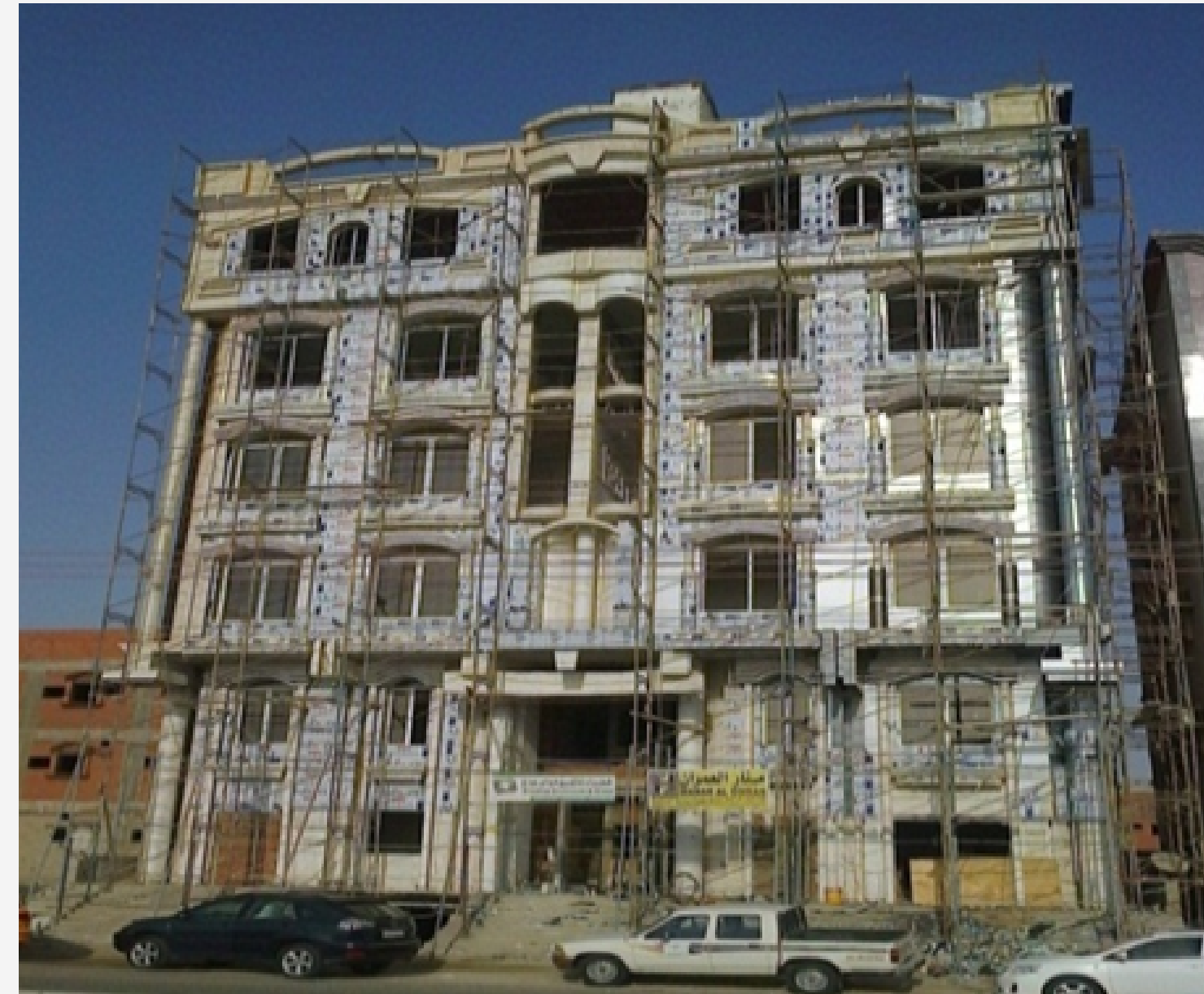
Qunfudah City, Beach Hotel