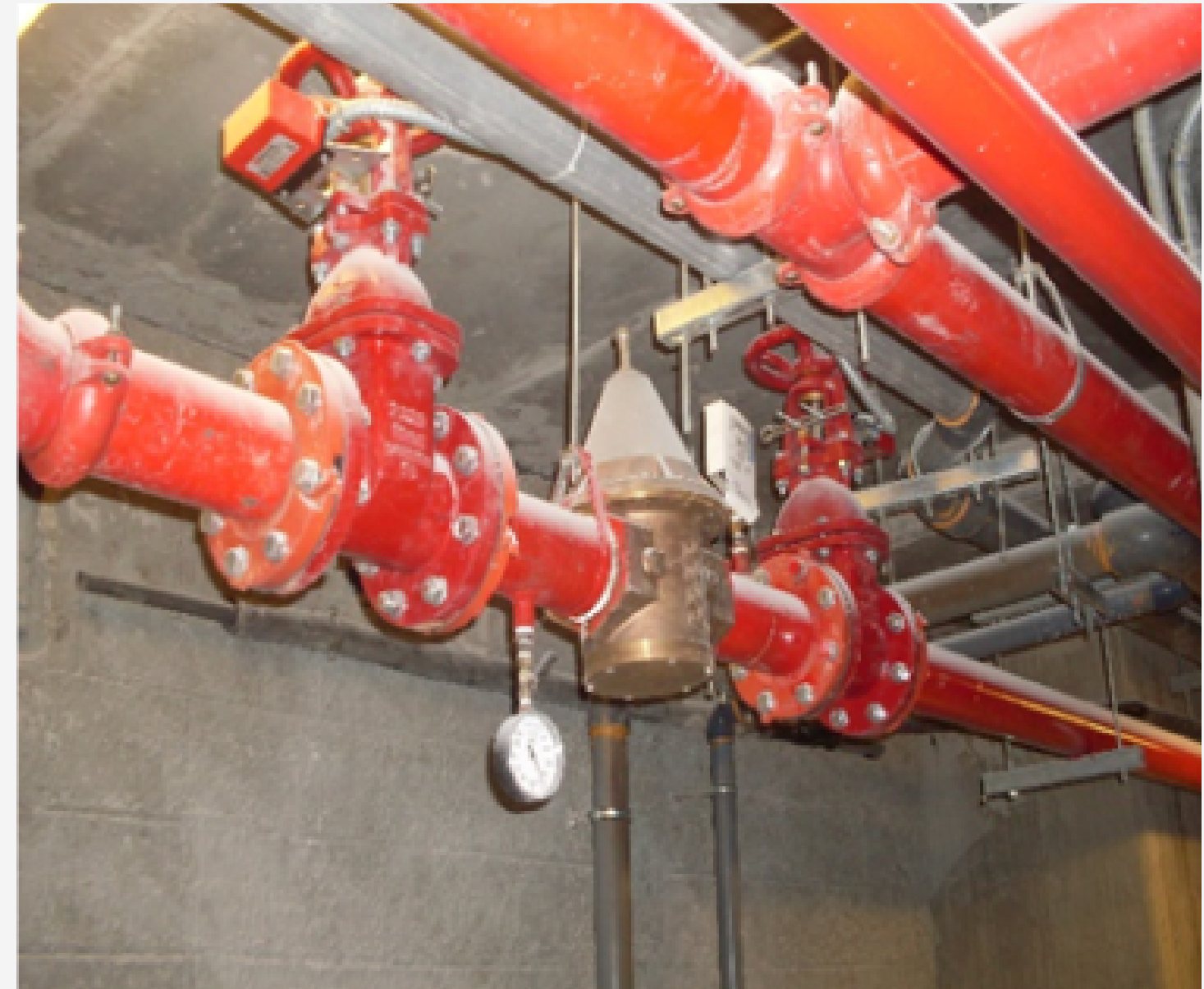
EDEN HOTEL, AL HAMRAH DISTRICT, JEDDAH Installation, testing, and commissioning of fire-fighting system