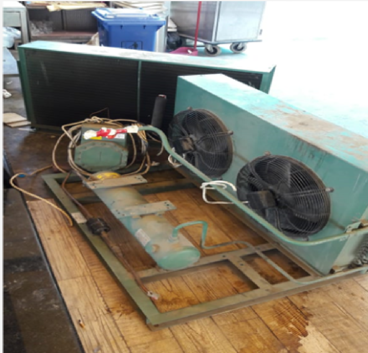
GOODTASTE RESTAURANT (AL SHATI DISTRICT), Jeddah Operation and Maintenance Annual contract for Refrigeration, and Air-conditioning system