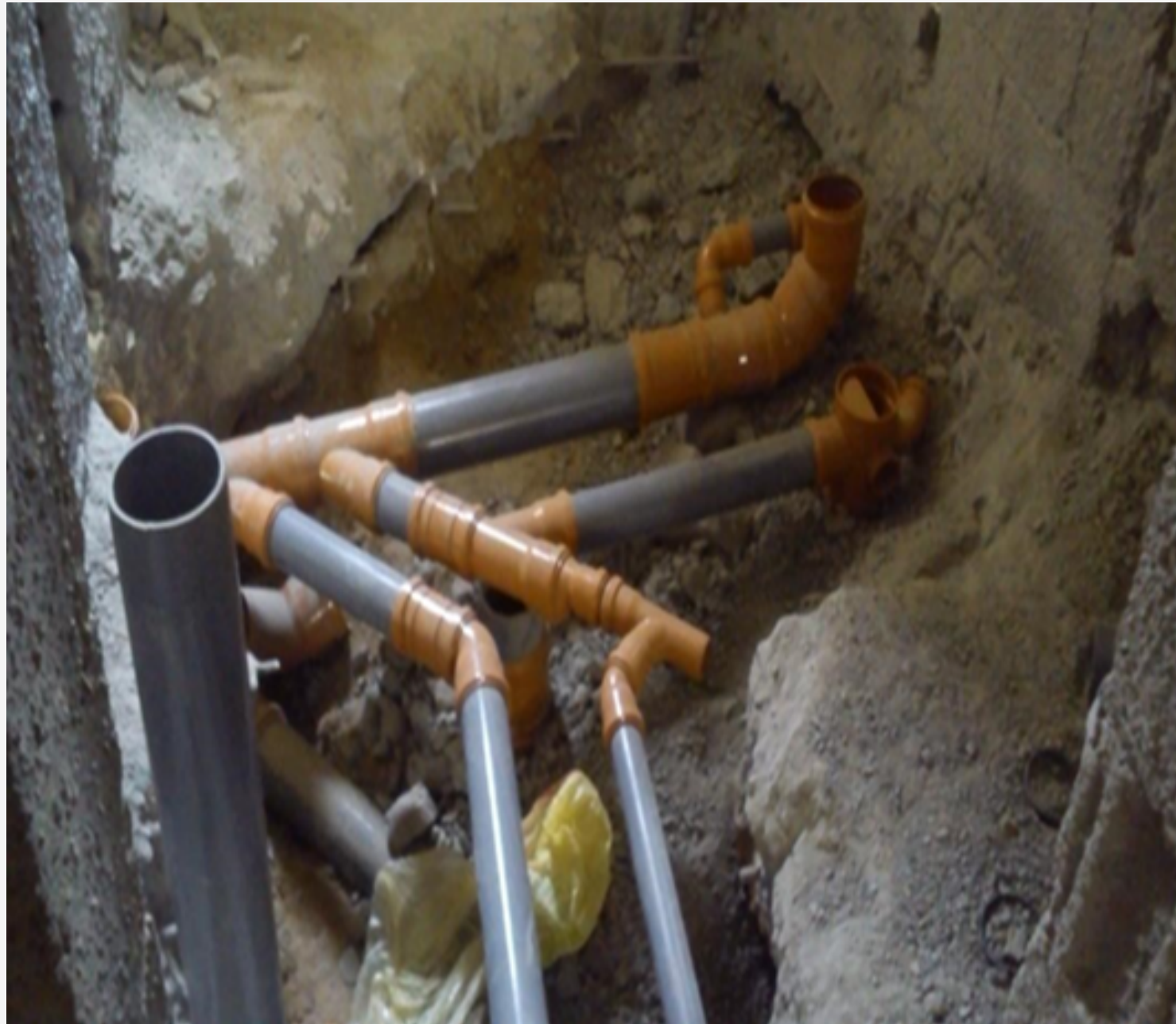
KING ABDULAZIZ UNIVERSITY FACULTY HOUSING PROJECT Jamaeh District Jeddah Supply & Installation of Electro- Mechanical Works