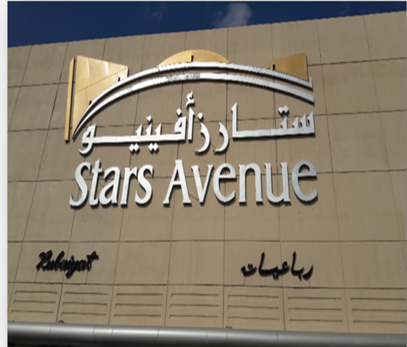
STARS AVENUE MALL, Sari Street, Jeddah Operation & Maintenance of Electro-Mechanical And Civil Works