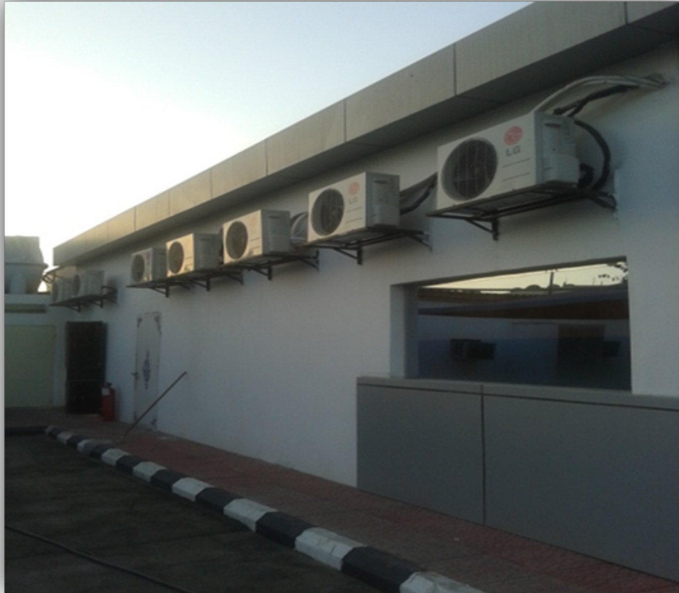
NATIONAL WATER COMPANY, Makarona Jeddah Supply & Installation of HVAC System