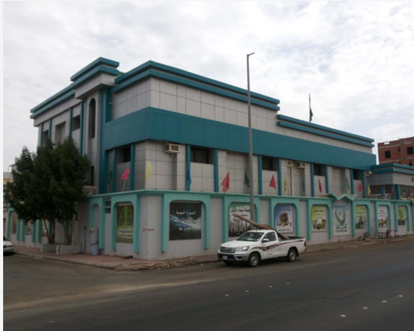
AL SAMEER DIST. SCHOOL BUILDING REHAB