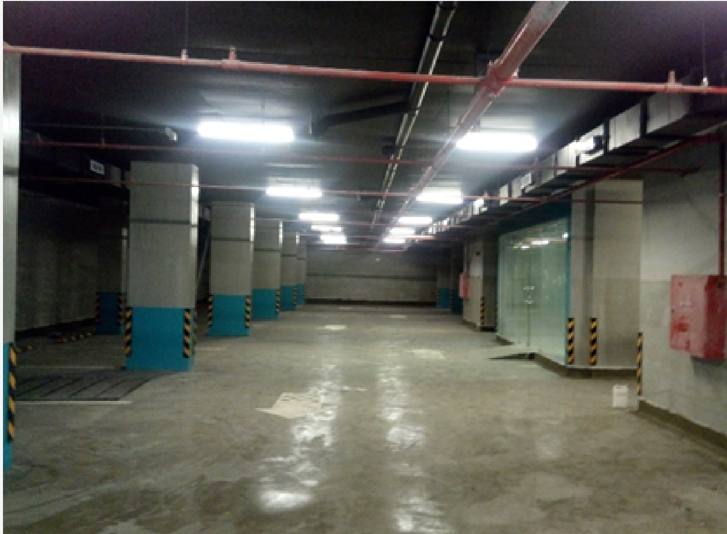
SHADDA HOMES, AL SALAMAH DISTRICT, JEDDAH Installation, testing, and commissioning of fire-fighting system