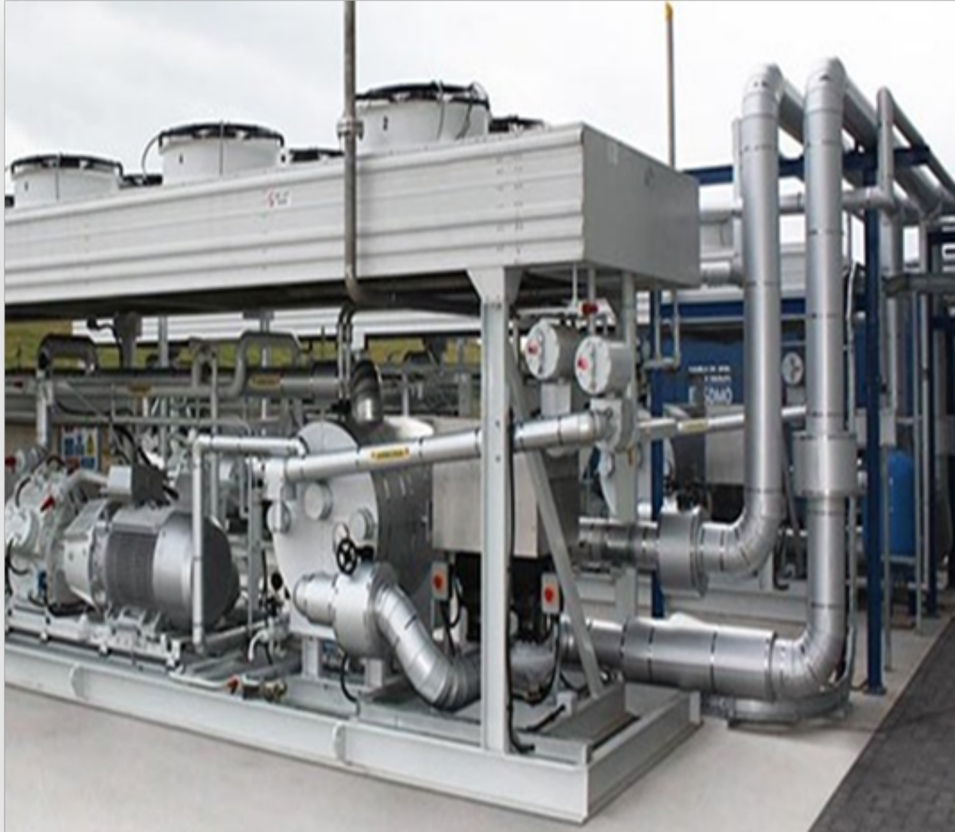
AL-BUSTAN HOTEL, Jeddah Operation & Maintenance of Chillers (HVAC System)