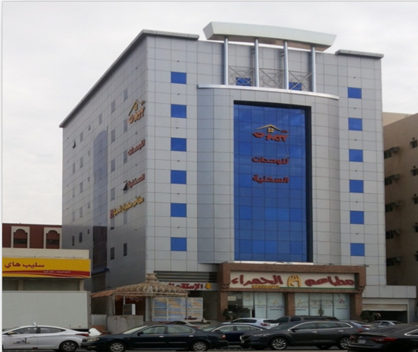
FALASTEEN ST. JEDDAH