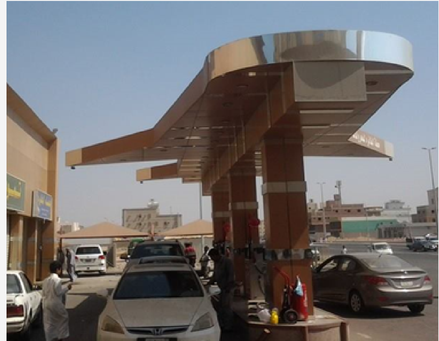
GAS STATION AL HAMDANIYAH DIST. ALUMINUM CLADDING