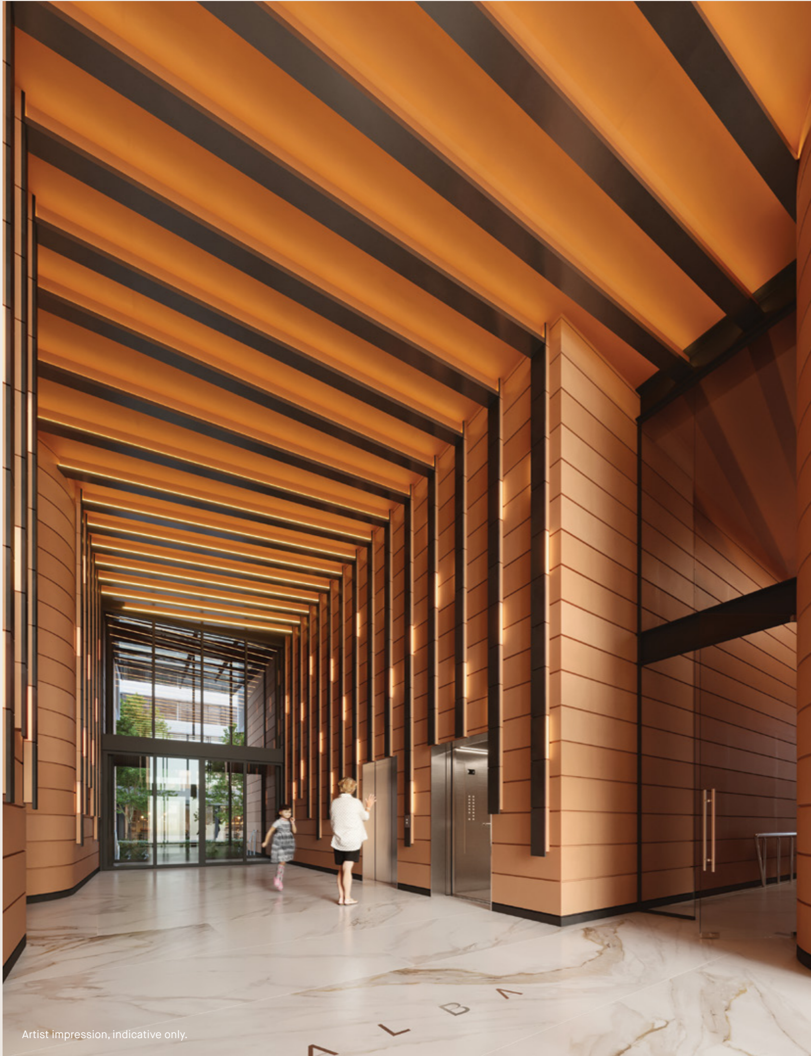
Artist impression, indicative only.