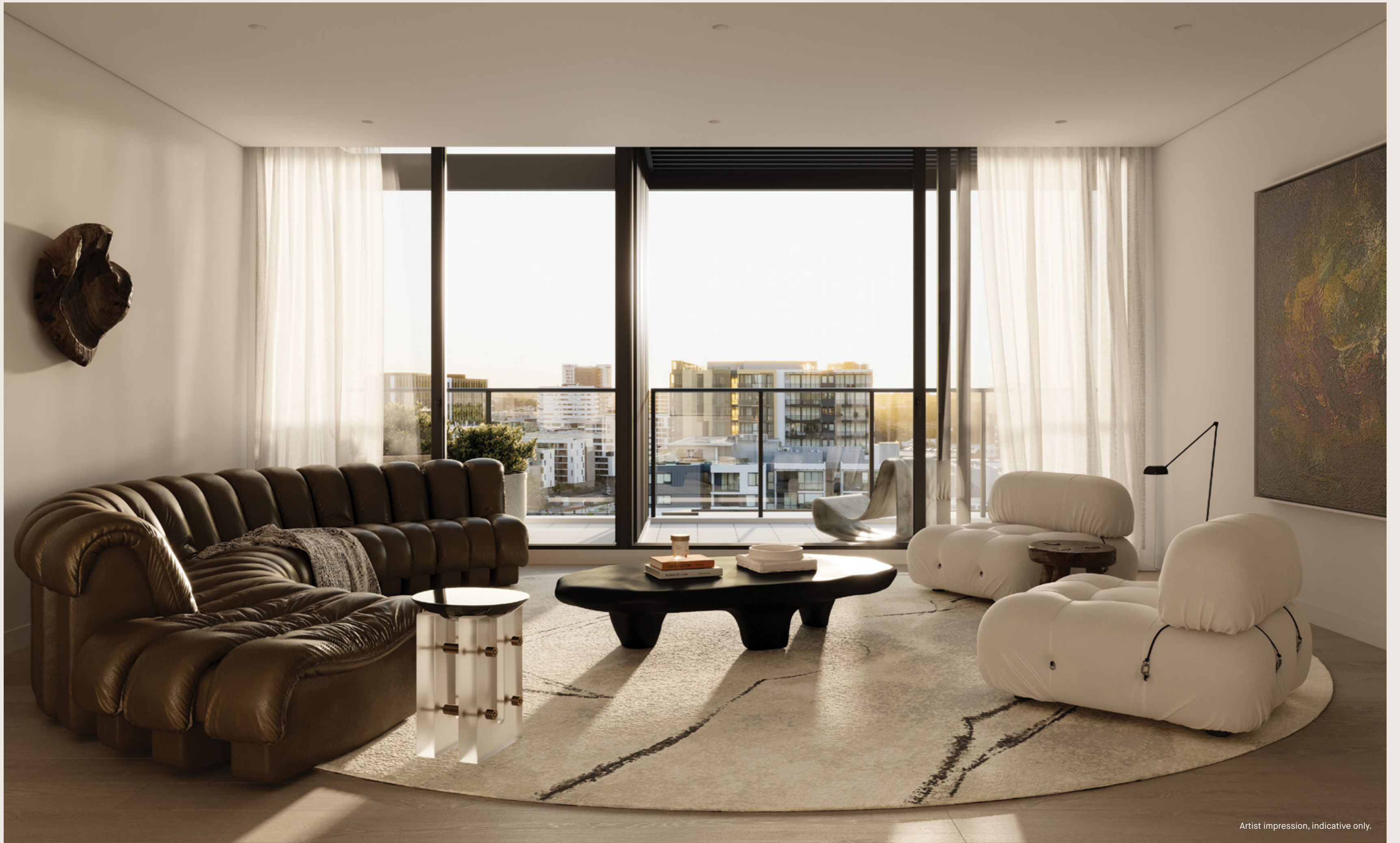
Artist impression, indicative only.