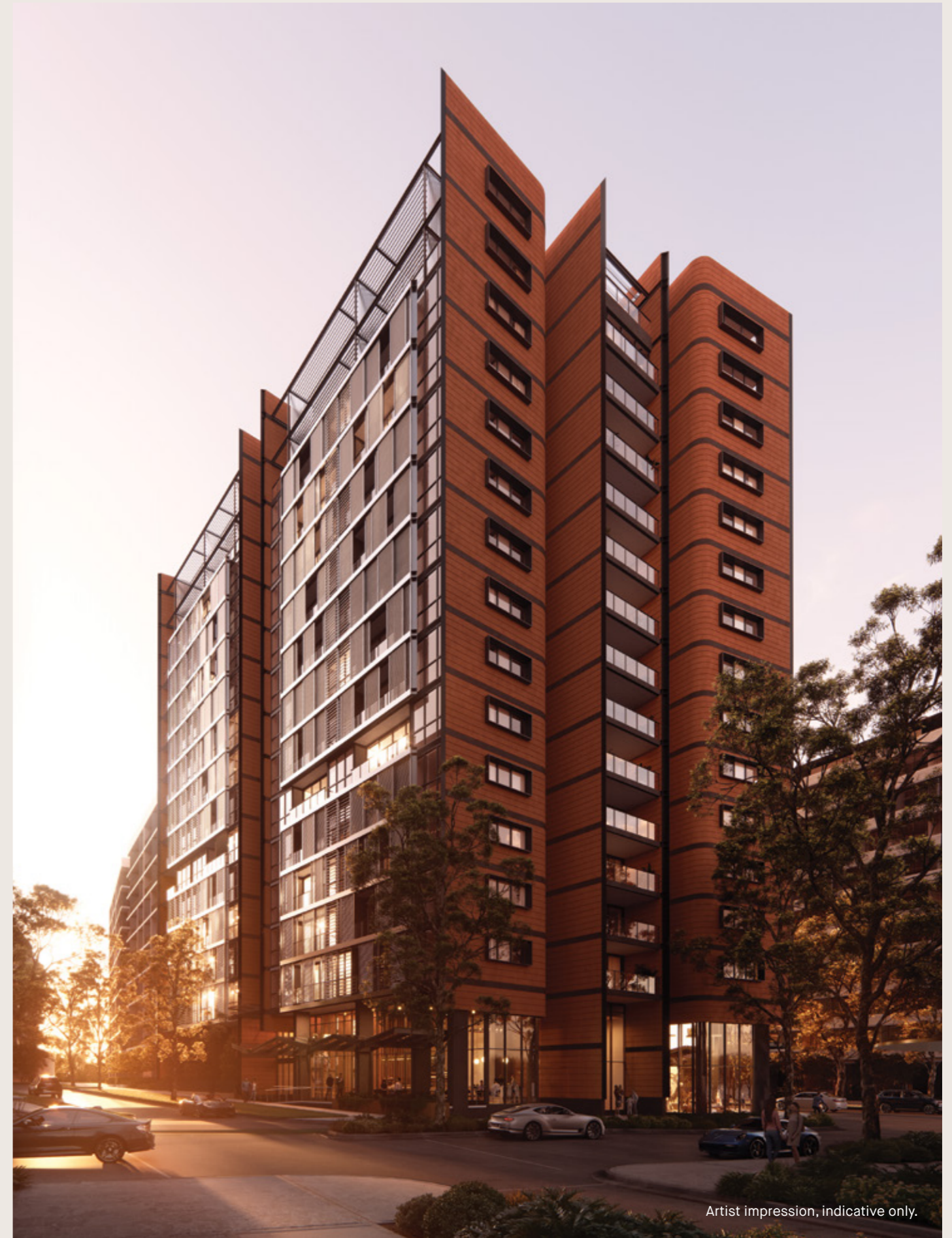
Artist impression, indicative only.

ALBA is beautifully crafted with a skin of warm, textured terracotta masonry, evoking the brickwork reminiscent of Green Square's industrial heritage. Beautiful from every angle, ALBA is honouring the past while looking to the future.