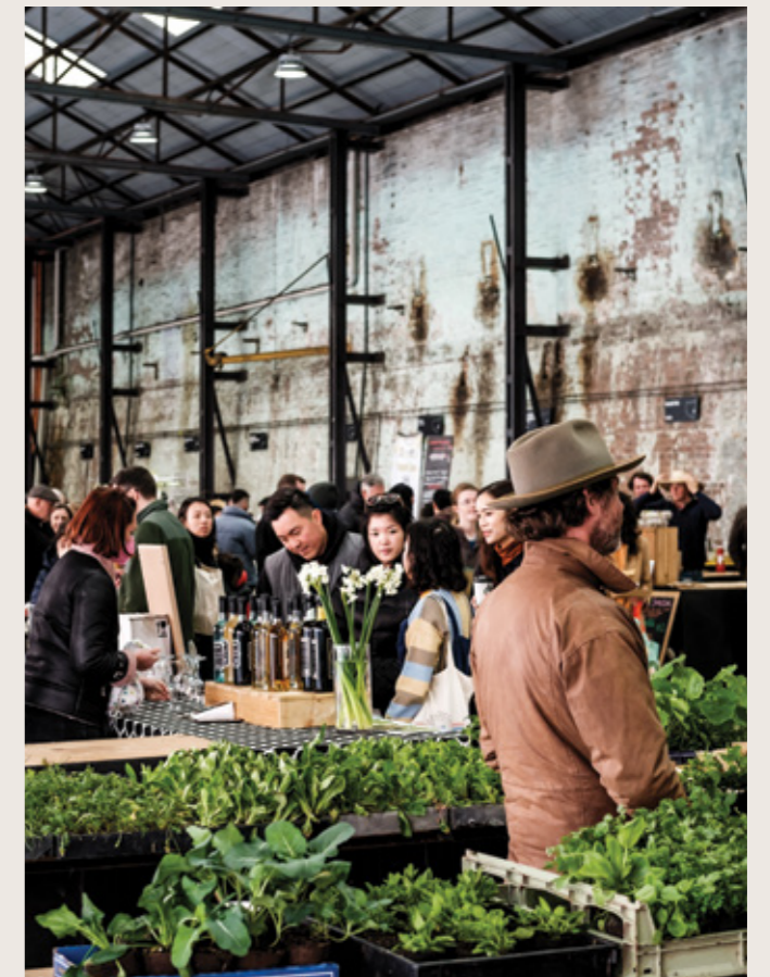
Carriageworks Farmers Market