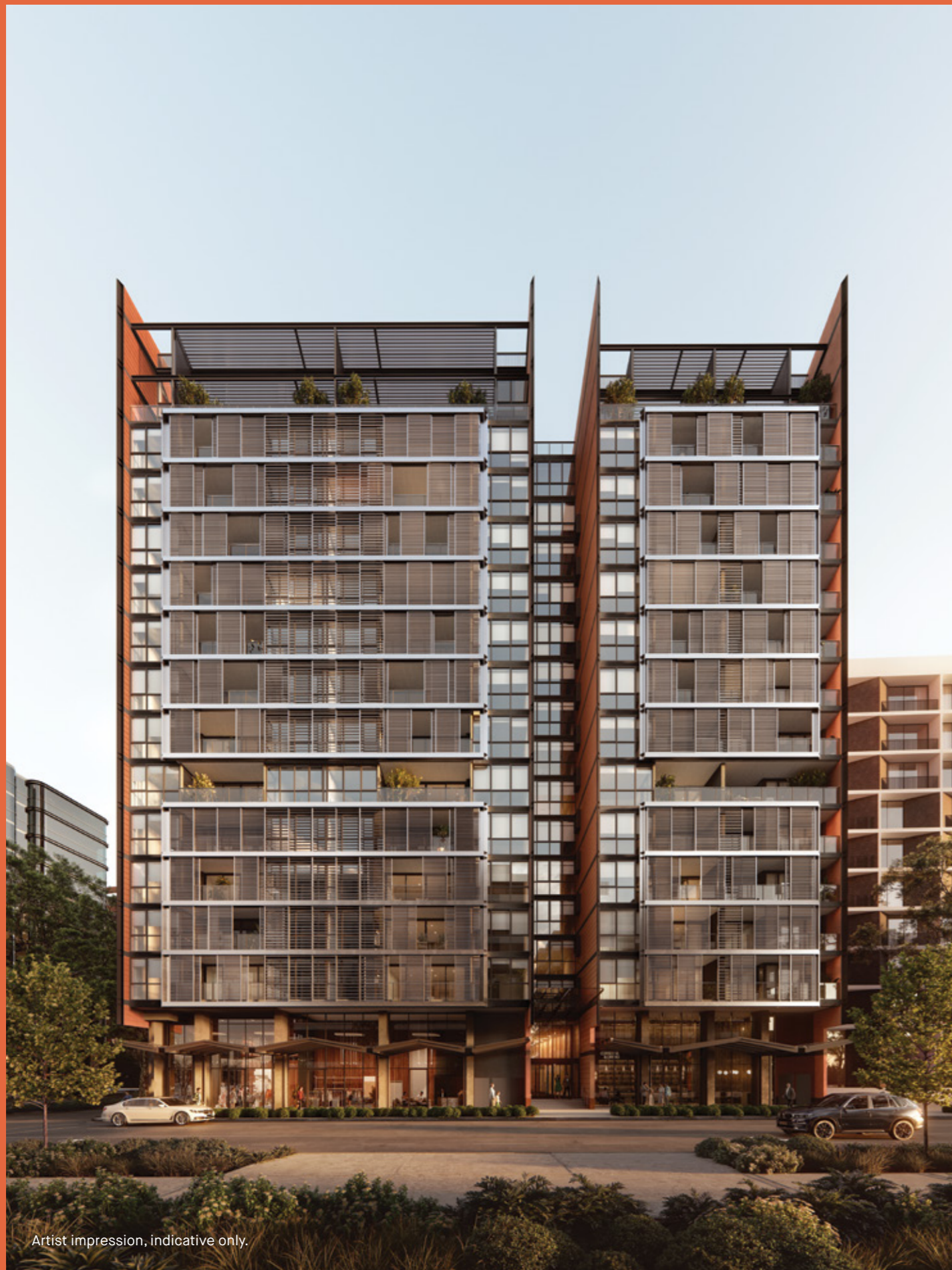
Artist impression, indicative only.