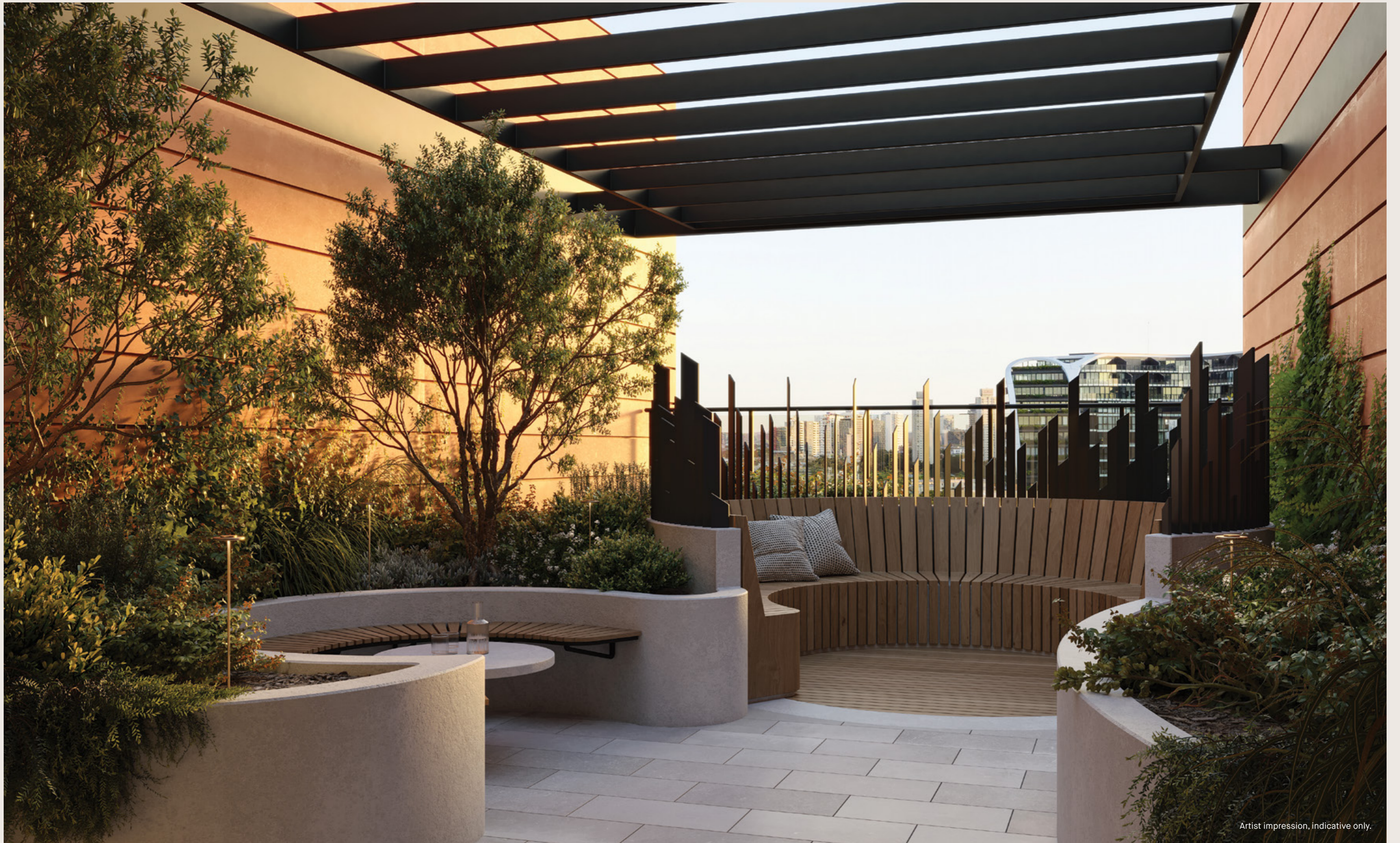
Artist impression, indicative only.