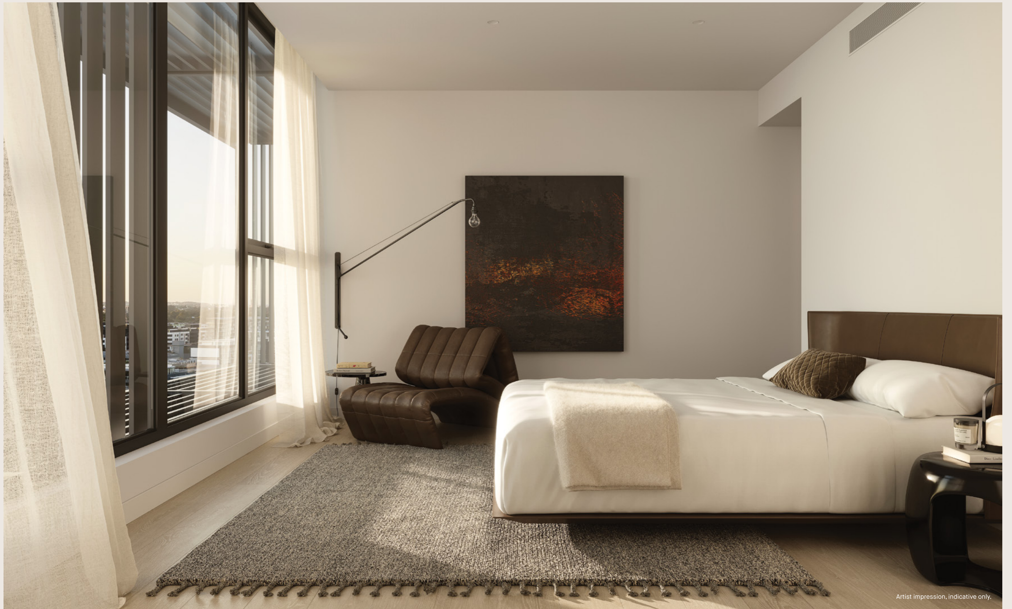
Artist impression, indicative only.