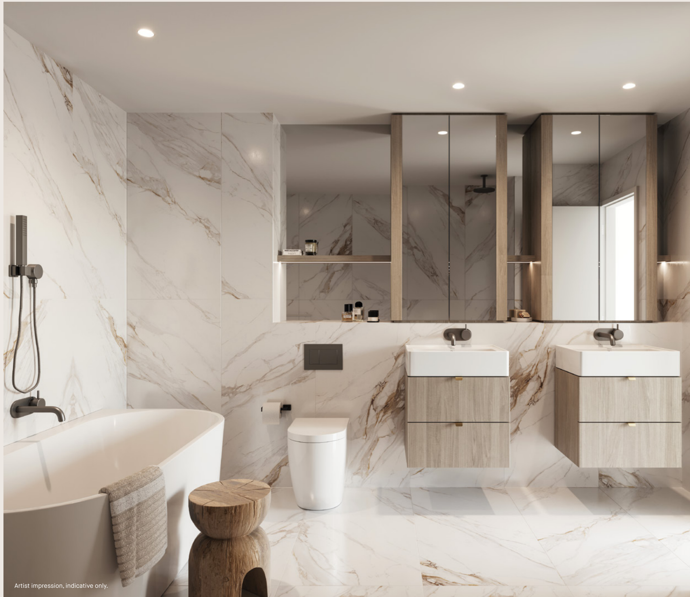
Artist impression, indicative only.

The excitement of dwelling in the heart of a thriving urban precinct is balanced by tranquil interior spaces of textured materials and exquisite finishes.