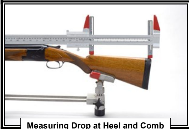
Measuring Drop at Heel and Comb Simultaneously