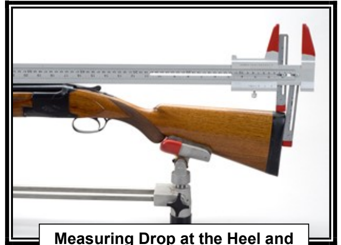
Measuring Drop at the Heel and Angle of Pitch Simultaneously