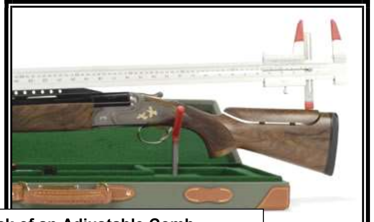
Measuring the Front and Back of an Adjustable Comb