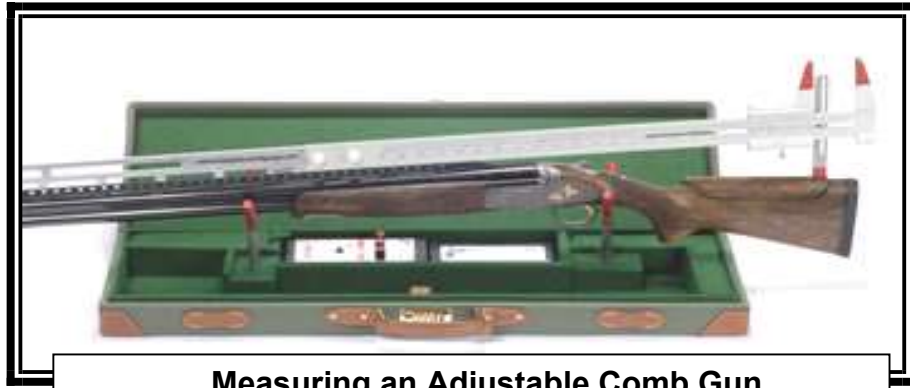
Measuring an Adjustable Comb Gun

The gun (a Caesar Guerini) is supported by the 2 yokes which convert the Gun Fitter's Case into a gun rest. The case stores a Shotgun Combo Gauge, a BoreMaster, and the All-Gauge LaserShooter and a LaserPro.