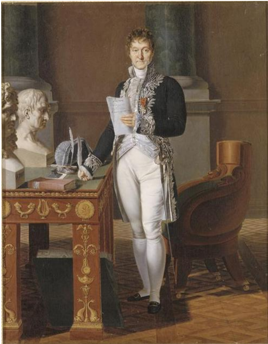
Lazare Carnot, Organizer of Victory

Carnot was born in 1753 in the small town of Nolay, in what was then Burgundy (today Nolay is in the Côte d'Or department and is not any bigger then it was when Carnot was born). He was the son of a royal notary and judge. He was well educated in a variety of subjects including the sciences; philosophy and mathematics. At an early age, he started receiving his extensive military education and he graduated as a first lieutenant from an engineering school at age 18.