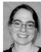
Elsa Hosch Recital Chair