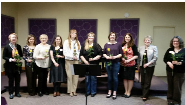
May 2016, Schmitt Music Auditorium, Roseville, MN