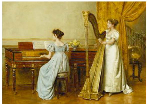
The Music Room , George Goodwin Kilburne