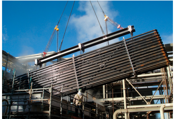
4. Replacement coils placed into tank assembly

Alfa Laval Niagara Phone +1 716-875-2000 Email: sales.niagara@alfalaval.com Web: www.niagarablower.com www.alfalaval.com/air