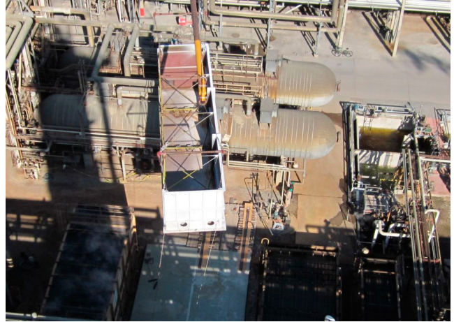
2. Placing the tank assembly into position