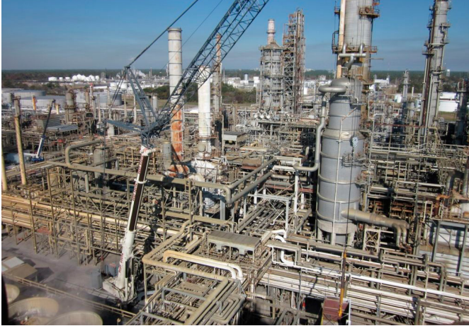
1. Overview of refinery