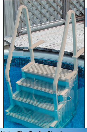
Note: The Confer-Step is designed for use in flat-bottom pools only. Our Pool Entry System can be adjusted to fit most dished-bottom pools.