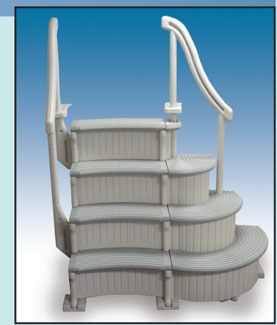
Above Ground Curve System