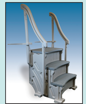
In-Ground Stair Case