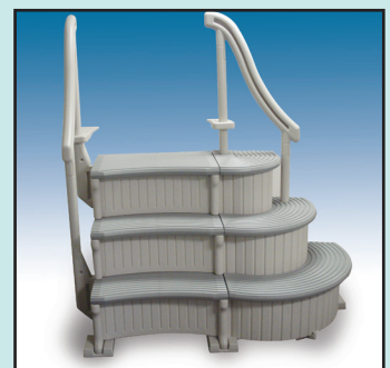
In-Ground Curve System