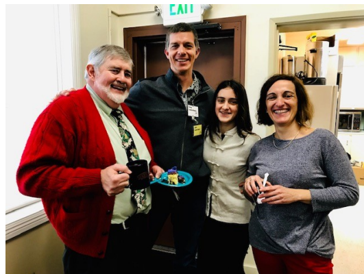
Finally, everyone tasted, no, devoured the treat, including most of the Cottin-Rack family.