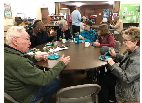
Here are more of the UUs who enjoyed cake and fellowship.