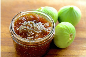
Fig Jam & Chutney Sale

It's that time of the year again! Clair has been busy making delicious fig jam, low sugar fig jam and fig chutney. 100% of the proceeds go to supporting our church. Each jar is $10.00. Jam will be for sale after church on most Sundays.