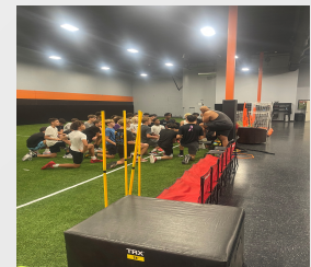
Inspiring Healthy Habits