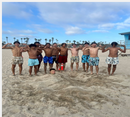
Travel Basketball Experience

The Charity Fundraiser is your invitation to be a part of something extraordinary. Together, let's turn dreams into reality, one heartfelt donation at a time.