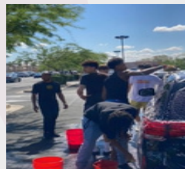
Building Confidence And Teamwork