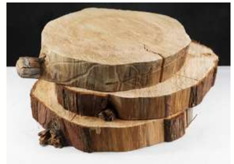
12" Wood Slab