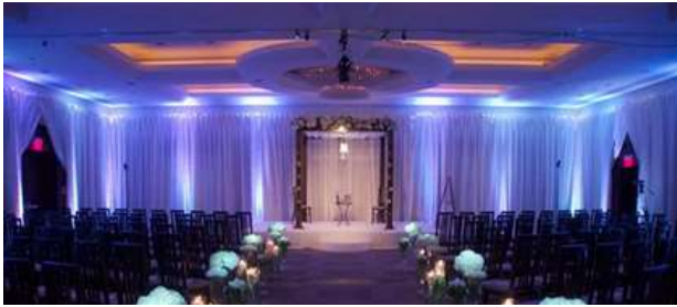
Uplighting $40 each