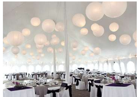
Paper Lanterns (any color) $195 per 30-40 various sizes (additional $75 to light them)

To reserve your rentals, email yourperfectdayllc@gmail.com or call 419.283.8200 $110/hour fee for Your Perfect Day to deliver, set-up & tear down (travel fees may apply). $600 minimum for all rentals