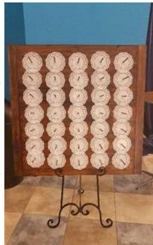
Doughnut Wall (with easel)