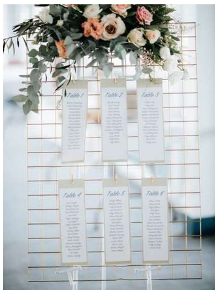
6' or 8' gold grids with clips