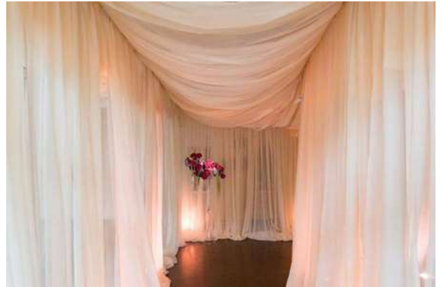
12' long Fabric Hallway $295 (includes 1 chandelier)