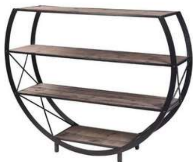
Iron Geometric Shelf 41.8" H x 54" W x 13.8" D $95