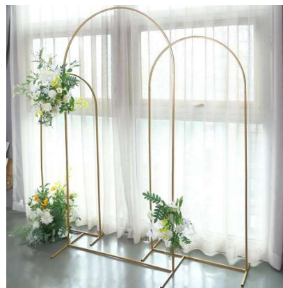
5', 7' or 9' gold metal arch $45 each