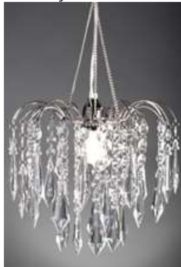
Tiered Crystal Chandelier