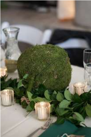
2", 4" 6" Moss Ball