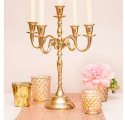
15" Gold Metal Candelabra