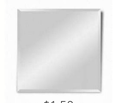
12" Square Mirror