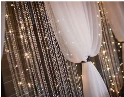
6' Crystal Curtains 12' Fairy Lights $28.50 each