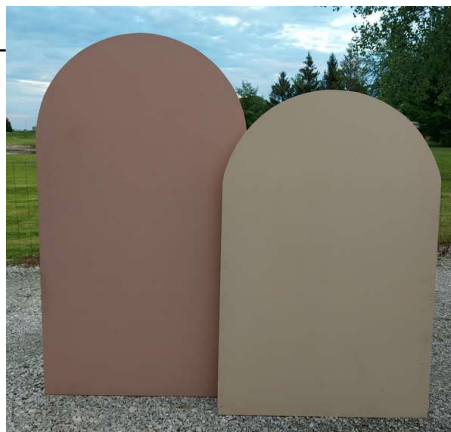
$145 for both