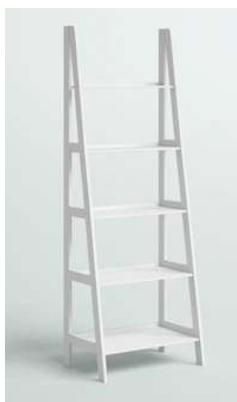
White ladder shelf 72.5" H x 25.25" W $45