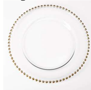
12" clear with gold rim charger plate