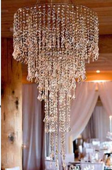
Tiered Crystal Chandelier