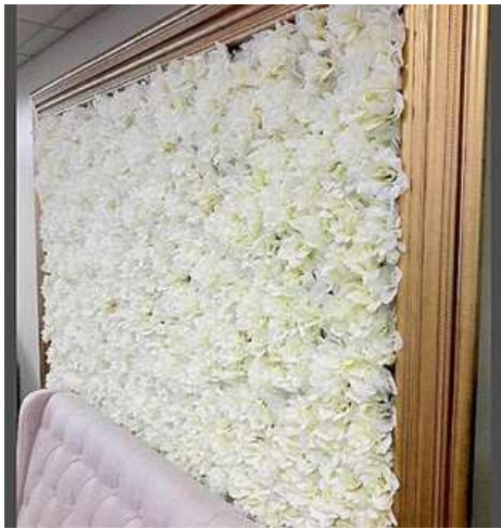
8' X 8' Boxwood or White Flower Wall Backdrop Starting at $195