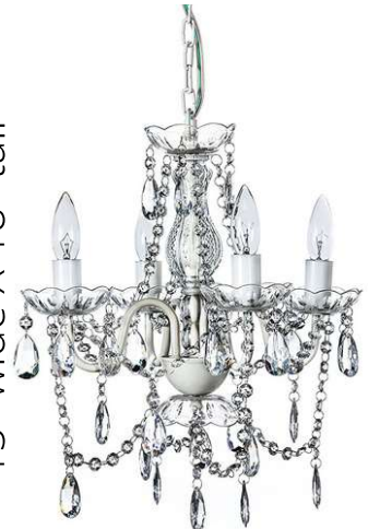
Mini crystal chandelier with lights