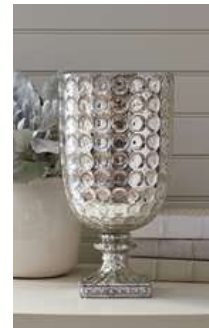
8.75" Mercury Vase