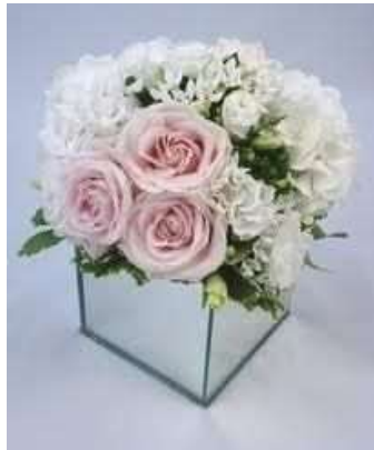
Mirrored Cube Vase