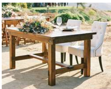
Mini Farm Table $65 each