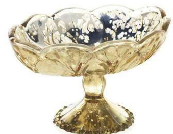
Mercury Carraway Vase