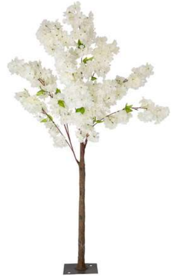
8' artificial light-up white tree $60 each