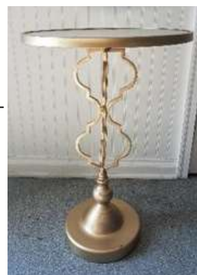
Gold Mirror Top Pedestal