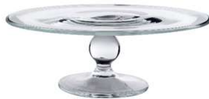
12" Glass Cake Plate