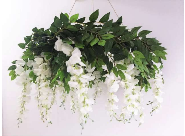
24" white wisteria chandelier