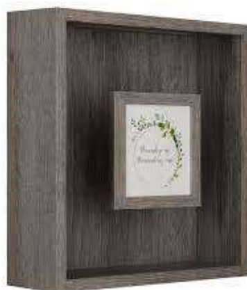
Grey Shadow Box with card slit