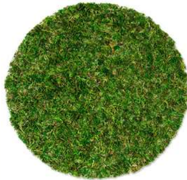
12" Moss Mat