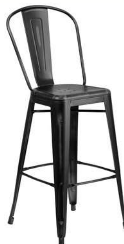
Black metal bar stool $30 each