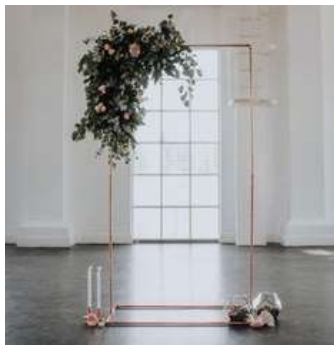
Copper Pipe $135