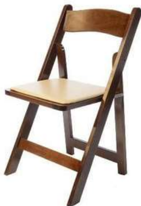
Fruitwood Folding Chair with Pad