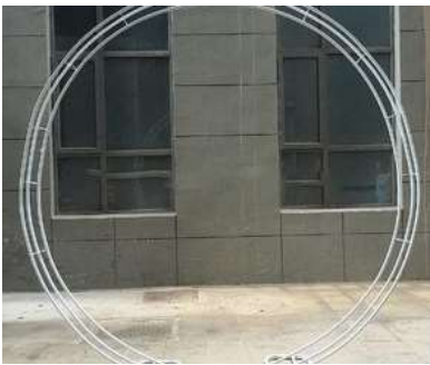
Circle Arch $105