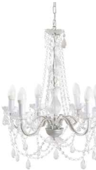
Crystal Chandelier with Lights