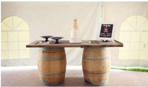
Wine Barrel or Old Door