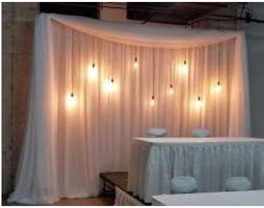
Edison Bulb Backdrop $185 per 12' Section

Custom Backdrops and Wall Coverings Available Basic White Fabric Backdrop is $85 per 8' section