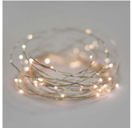
2' strand - $3.50 8' strand - $8.50