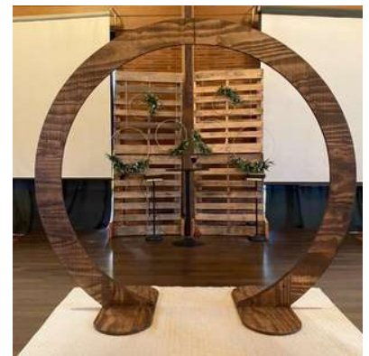
Wooden circle arch $145

To reserve your rentals, email yourperfectdayllc@gmail.com or call 419.283.8200 $110/hour fee for Your Perfect Day to deliver, set-up & tear down (travel fees may apply). $600 minimum for all rentals