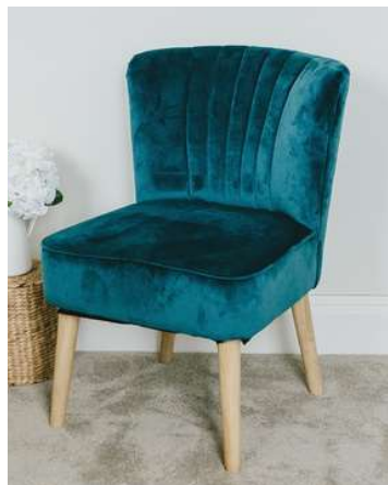
Teal Velvet Chairs