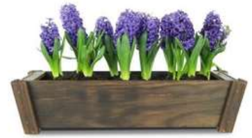
Planter Box (24" X 7")