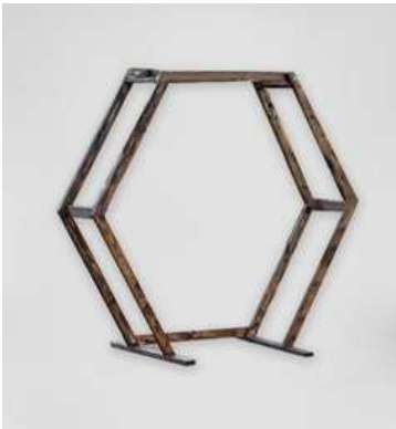
Wooden Hexagon $175