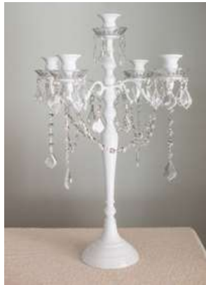
24" White/Gold Candelabra