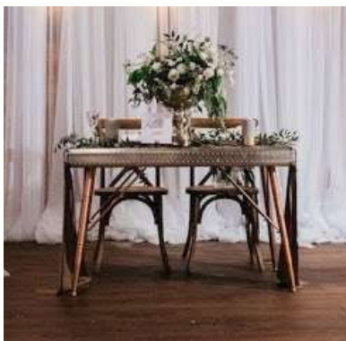
Metal Sweetheart Table $65