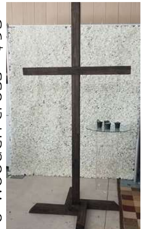
6' wooden cross - $95

To reserve your rentals, email yourperfectdayllc@gmail.com or call 419.283.8200 $110/hour fee for Your Perfect Day to deliver, set-up & tear down (travel fees may apply). $600 minimum for all rentals