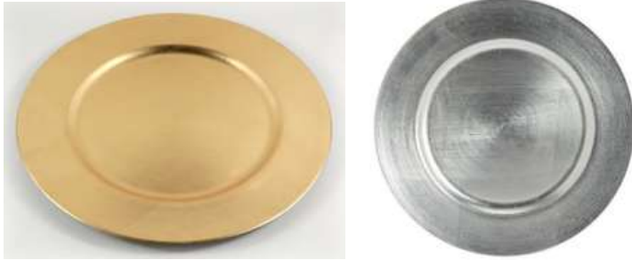
12" gold or silver charger plate