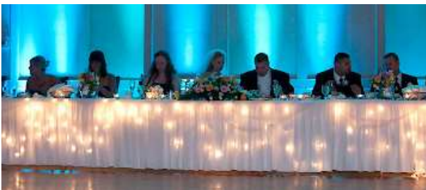
8' banquet or 72" round $30 each