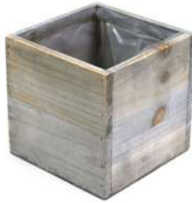
6" Wooden Cube