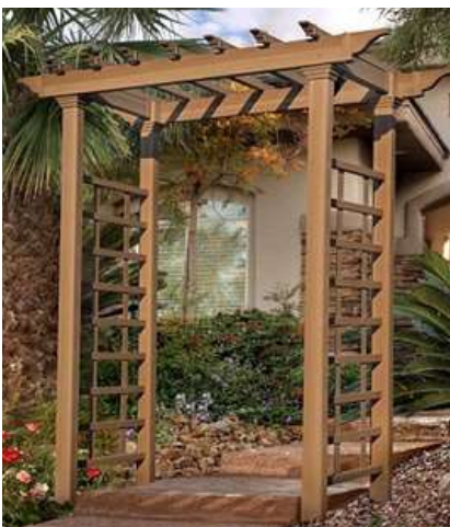
Wooden garden arch $115