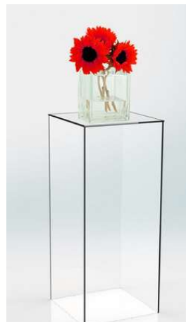
3' acrylic stand