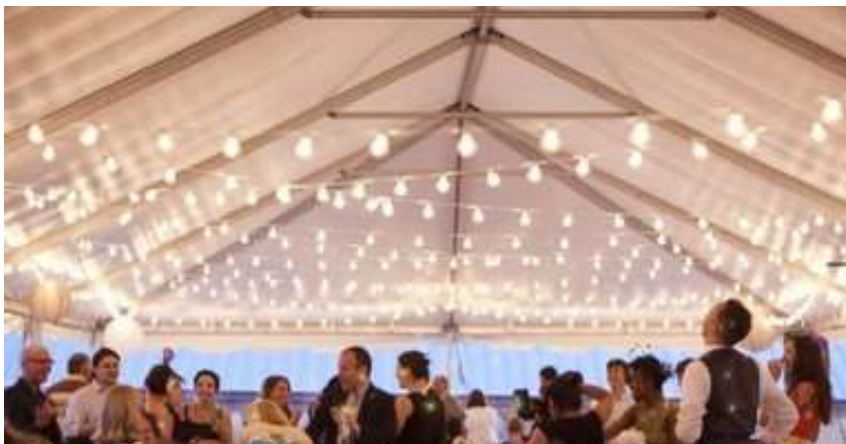
White Wire Globe Lights $65 per 50' strand