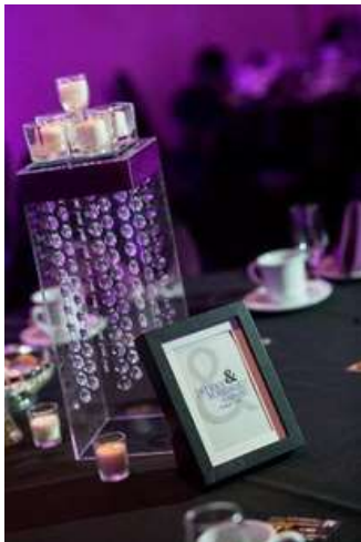
14" X 4" Plexiglass Box