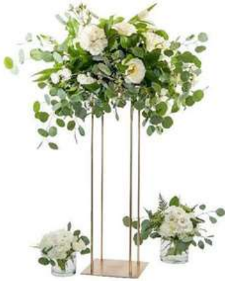
24" Gold Metal Stand