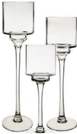
10", 12", 14" Floating Candle Holders