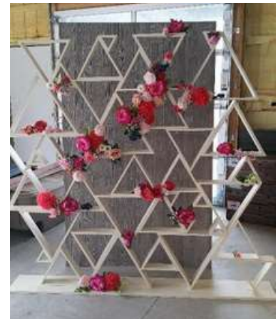
Geometric Backdrop $125