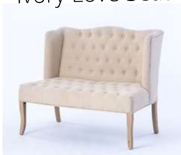
Ivory Love Seat