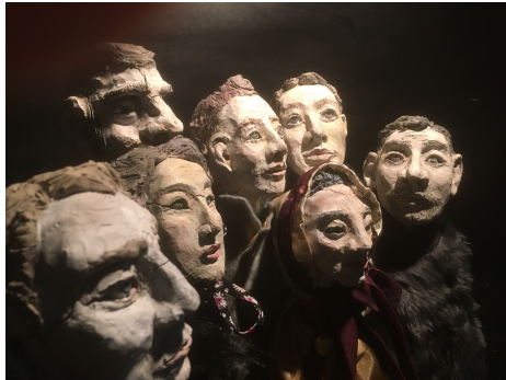
Mammets (Family), 2018

Heritage and the sense of personal identity, –who am I–, is a human concern, which affects people from all cultures across the globe. Oral histories recounted from generation to generation, to those transcribed, documented and archived, can provide the researcher with rich information for narratives and discourse. Genealogy, the study of family