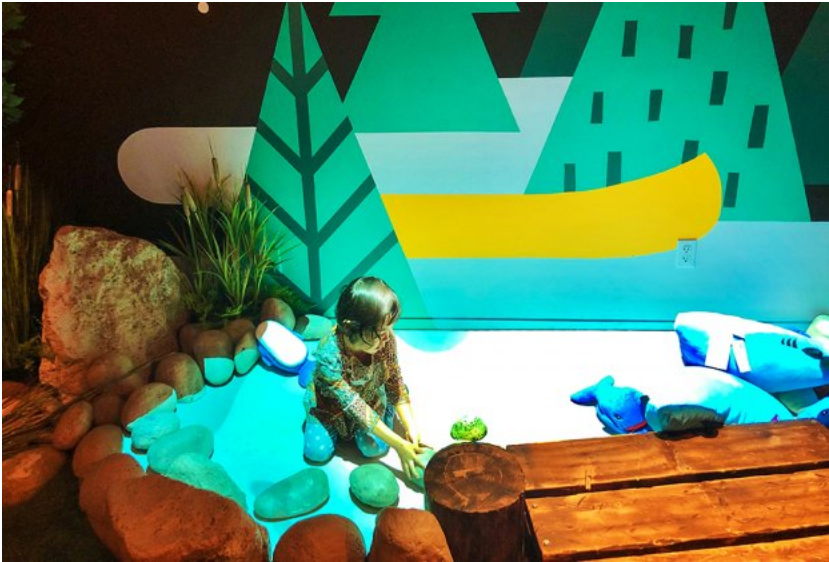
Explore the lake and campfire, where touching toys is encouraged.

Some of the fun, interactive elements in the space that will keep us coming back? A bunk bed with a tube slide that lands you right into the Dance Hall, where, much to the delight of my daughters, the walls are covered in mermaid-style sequins for tons of sparkly sensory fun. At The Lake, we had fun running up and down a mini-bridge, which doubles as a piano ( watch out, FAO (https://mommypoppins.com/new-york-city-kids/stores-services/fao-schwarz-returns-to-nyc-next-week-with-new-store-in-rock) !) for lots of music-making fun. I had the hardest time pulling them away from the Lick-A-Bubble table in the Canteen, where a staffer endlessly mixed and blew bubbles for them: cake-flavored bubbles, unicorn (aka cotton candy)-flavored bubbles, and even root beer-flavored bubbles. The Mail Room and Arts and Crafts stations were so entertaining, I had to bribe them with a trip to Milk Bar to leave the store. S'mores-themed ice cream sundaes for the win!