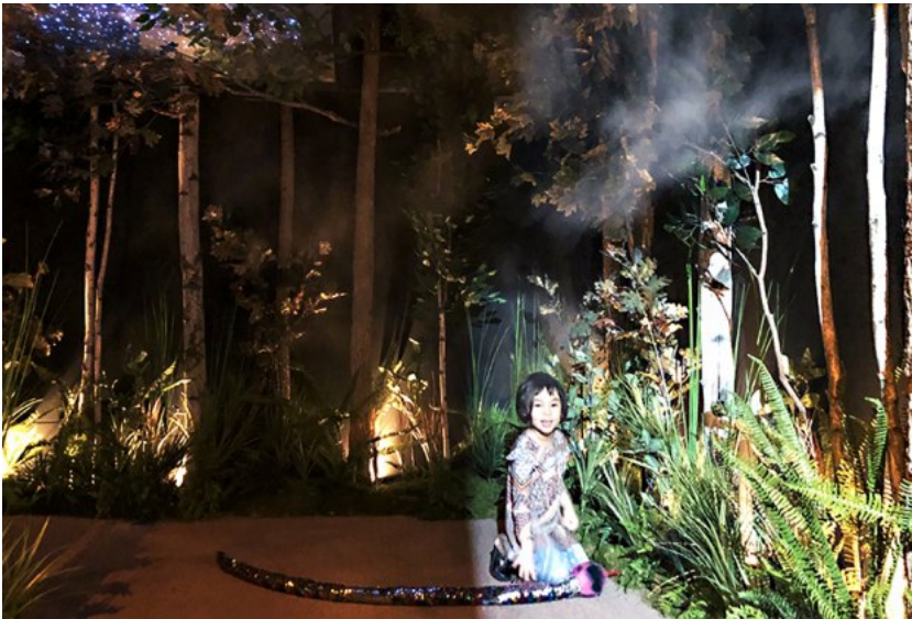
A visit to CAMP wouldn't be complete without exploring the forest, which is a safe and engaging space for the younger crowd.