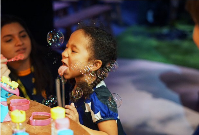
Flavored bubbles blown by a camp counselor were a huge hit.

RELATED: NYC's Most Amazing Destination Toy Stores (https://mommypoppins.com/new-york-city-kids/top-nyc-destination-toy-stores) .