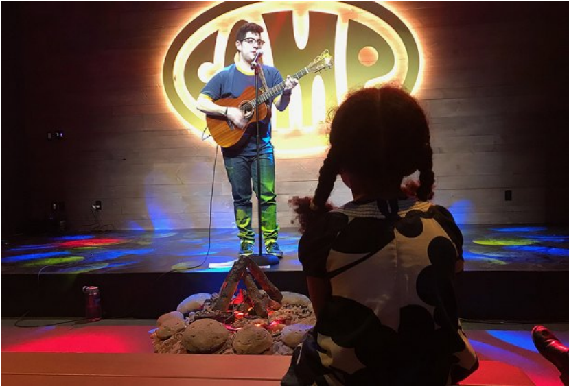
Listen to some tunes around the campfire.

While the space itself is tons of fun, and interactive in so many ways, the staff also makes the experience memorable. Touching and playing with toys is encouraged. My 5-year-old commandeered a ride-on horse and rode laps, which not only wasn't frowned on, it was actually encouraged—in large part by the staffer who was racing circles around her on a scooter of her own. At the bubble station, the counselor took special care to get down to her level to make sure she got to taste the bubbles when my older daughter and her friend were licking the higher ones up too quickly. And, a no trip to camp would be complete without a few songs around the camp fire. Not only did we hear the original CAMP theme song, but also a rendition of "Shake It Off," "We're Going on a Bear Hunt," and "Baby Shark," all played and sung by a musician-turned-counselor.