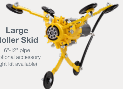
Large Roller Skid 6"-12" pipe (Optional accessory light kit available)