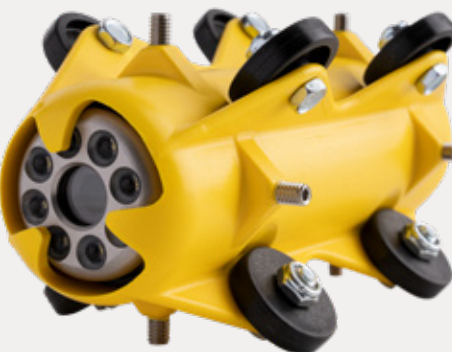
Small Roller Skid 3"-6" pipe