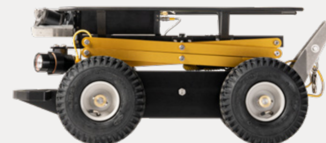
Transporter: Steerable Storm Drain Cameras: TrakStar, TrakStar II