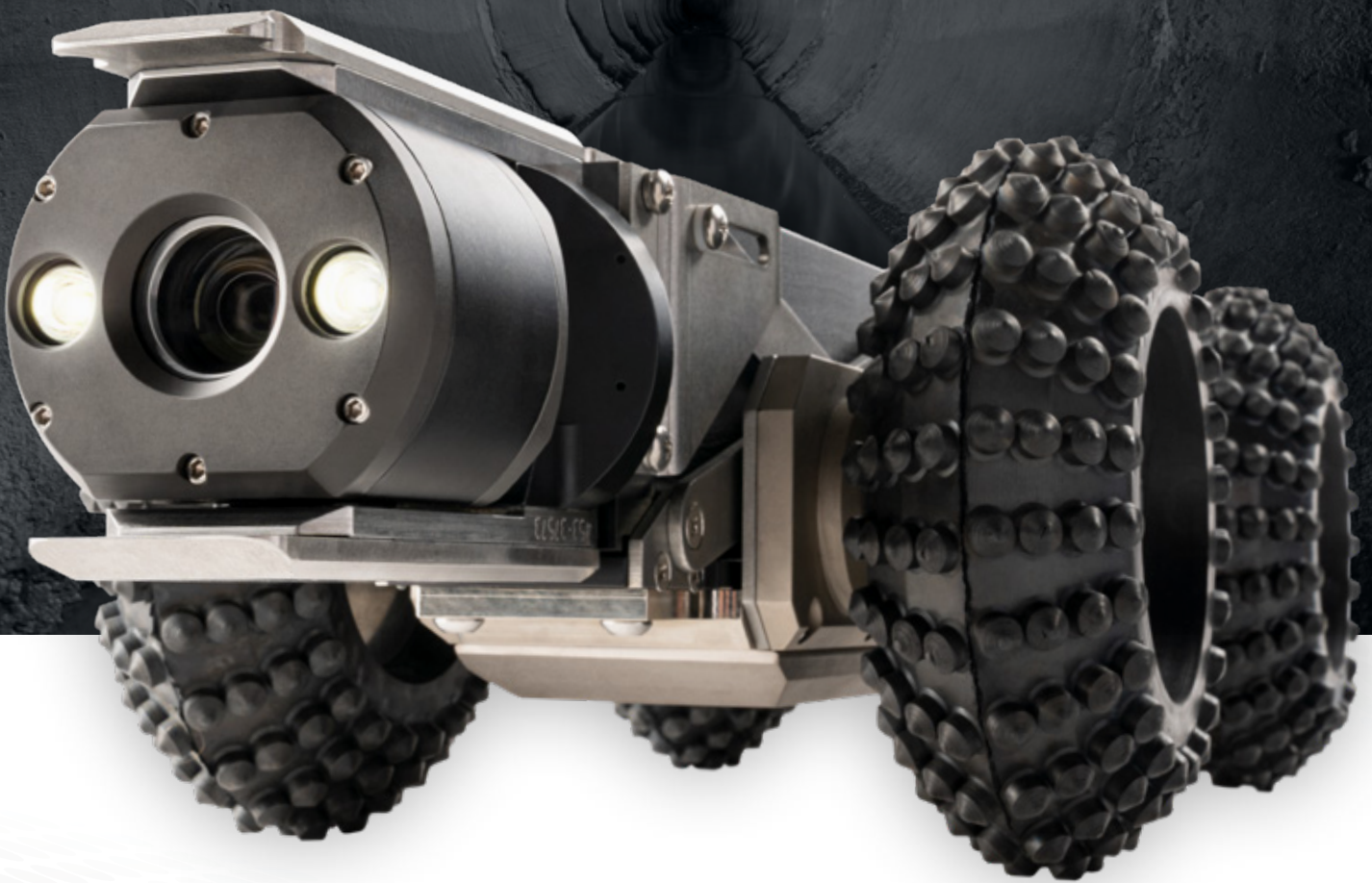
TranStar Utility Inspection Transporter