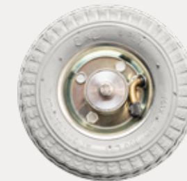
Pneumatics 6" / 8"