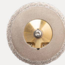
MegaTrak 2.7" / 3.3" / 4.5"