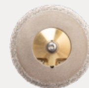
MegaTrak 2.7" / 3.3" / 4.5"