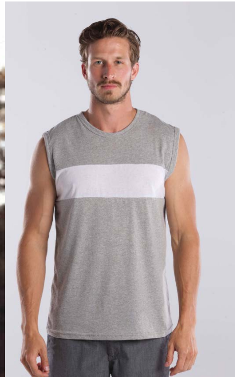
(L-R) Tri-Blend, 100% Organic Cotton, Hoodie, Recover Upcycled Textile System