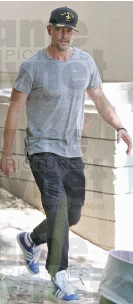
(L-R) Josh Duhamel (Skater Tee), Amber Heard (Goddess Tank), Justin Timberlake (Skater Tee), Kate Hudson (Halter Bodysuit)