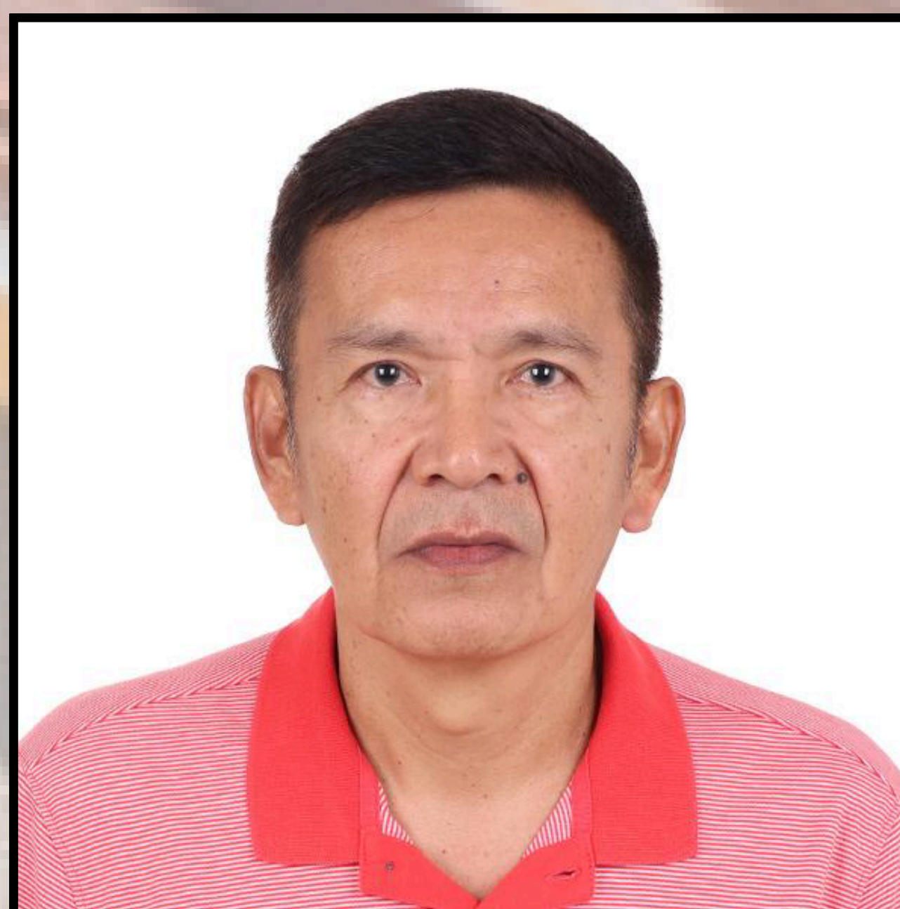
ISAGANI LABRADOR PHASE 1