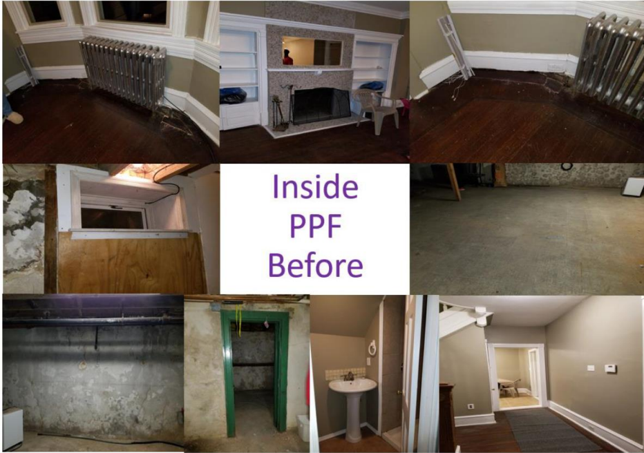
Inside PPF Before

3 Years since PPF moved to 11 Owen Ave, Lansdowne location!