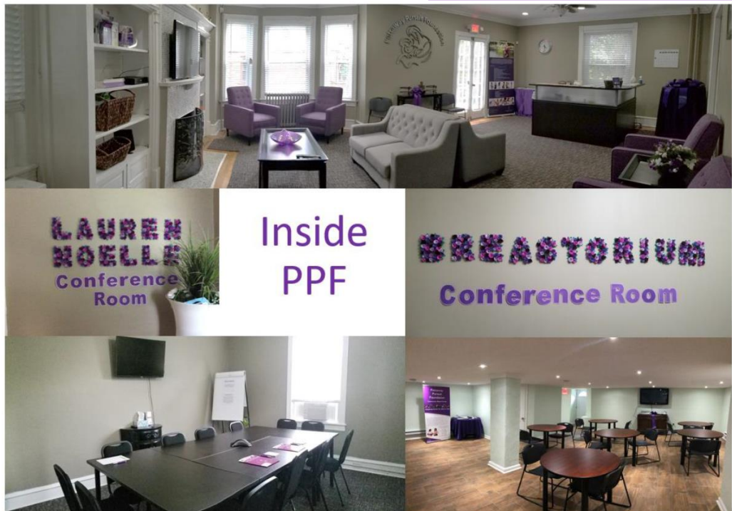
LAUREN NOELLE Conference Room

Here's a look from before and after the property remodel.