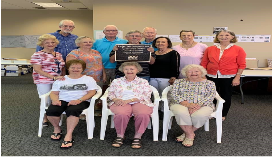
Alabama 200 Bicentennial Legacy Award