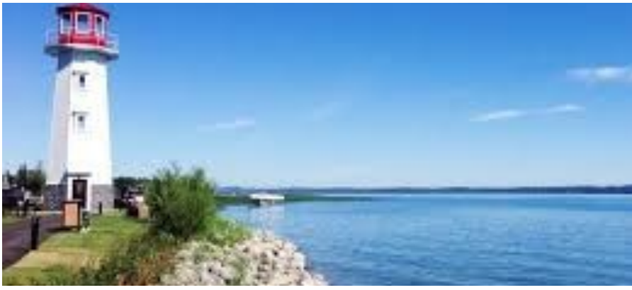
Iconic Alberta lighthouse unveiled in Sylvan Lake