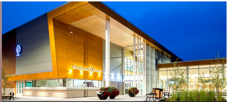
NexSource Centre, Sylvan Lake

“This was fantastic, and helped all of us revisit some of the things we heard and learned during the day. It is amazing to hear from experienced leaders, and see what they focus on, to figure out for ourselves how to be better leaders to our teams.”