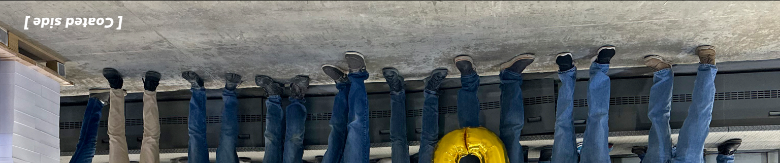
[ Coated side ]

to harden the surface. Basic copy paper is an uncoated sheet. Offset printing on an uncoated sheet will make your image look duller or muted. Many creatives/designers will opt for this printing surface as it will give the final printed piece a "softer" feel. There is also paper that is coated only on one side making the sheet, coated and uncoated, better known as a C1S sheet. In this issue we have chosen to use 10pt C1S. It's just a matter of preference. There's not a right or wrong way to go. Contact your ULitho account executive for samples of each so you can decide what will work best for your next project.