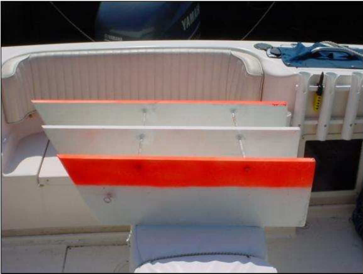
Setting out boards at 100 ft, boards are at a good angle - horizontal to the boat.