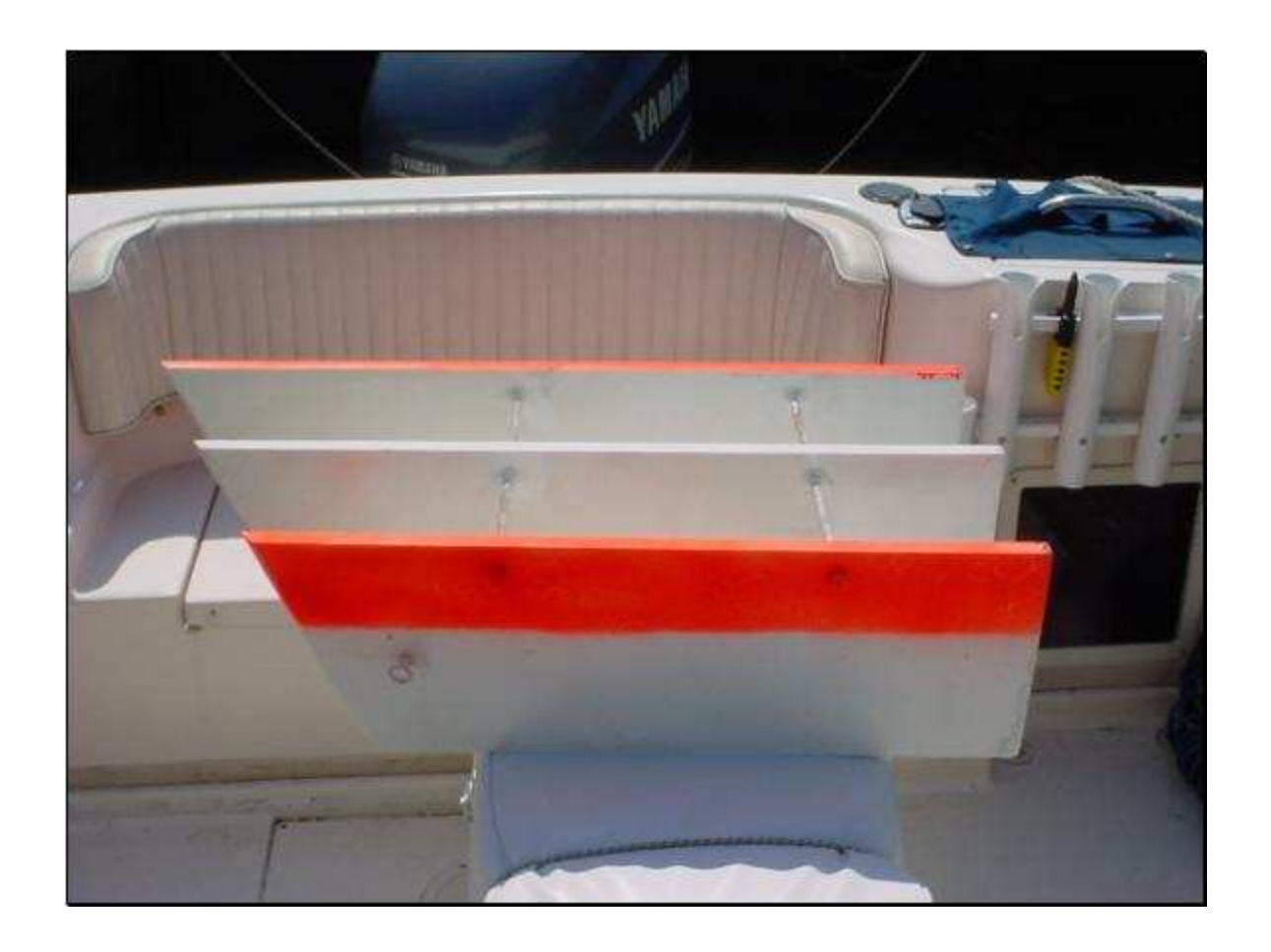
Setting out boards at 100 ft, boards are at a good angle - horizontal to the boat.