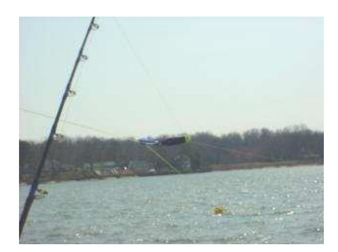
With 1 umbrella @ 100feet, the boards start to pitch and pull and were close to flipping.

Started rigging with 1 umbrella and boards started pulling back further