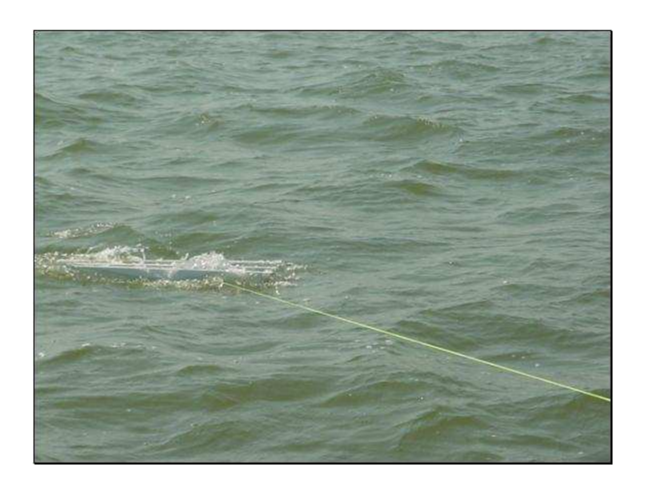
Running and setting slow, the boards ran way back and low in water At 60-75 feet out almost sunk and way back