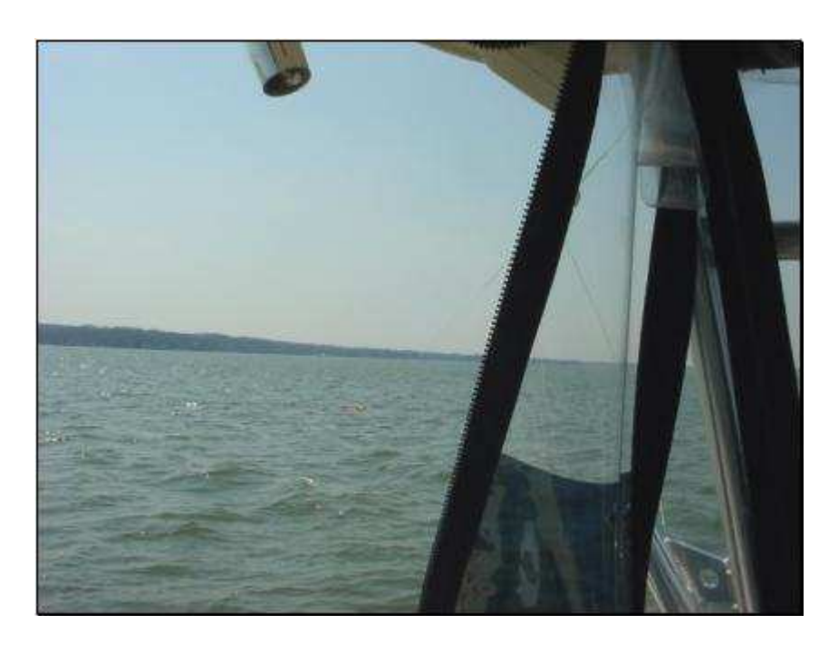
Board set out with 1 umbrella in slight chop shows good angle and no tendency to flip. I run up to 4 Umbrellas on this setup