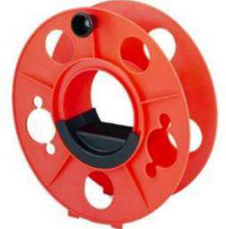
Available at h/w stores for around $7

Electric line winder used for keeping running line coiled properly and easy storage