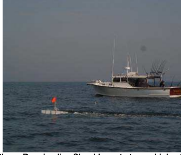
Note Planer Running line Should run to top or highest and out to Planer

Electric line winder used for keeping running line coiled properly and easy storage