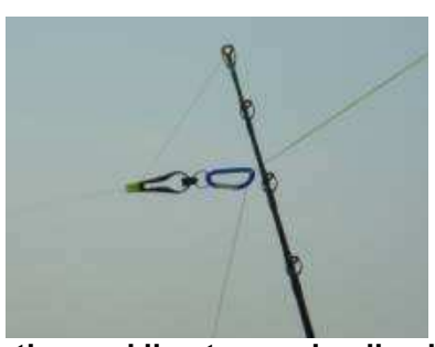
Connecting reel line to running line is easy with a Scotty Clip setup. Alternative is to use thin rubber bands to to connect to rod line and D-Rings for easy connect to the running line.