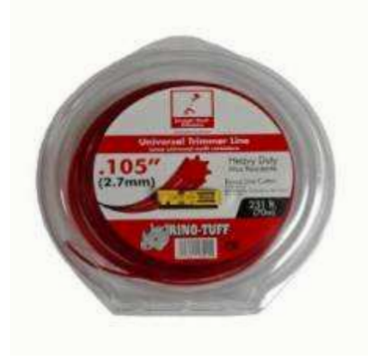
Use100-150 foot on each side with boards runni about 75-125 foot (with bow in line)

Weed Whacker/Trimmer line used for Runnir .095 or .105 (preferred) Trimmer Line