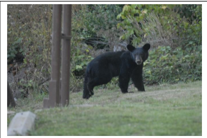
Juvenile Black Bear