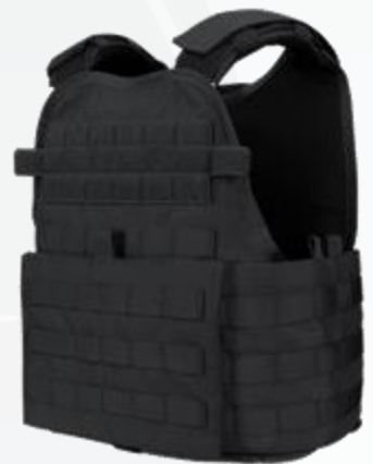
PLATE CARRIER SPECS