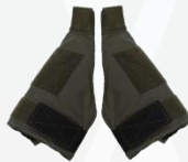
Increase your coverage and maintain mobility with the Bicep accessory