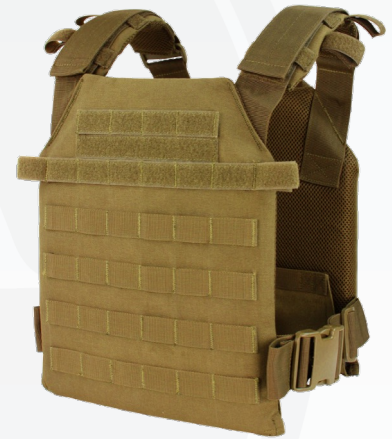
PLATE CARRIER SPECS