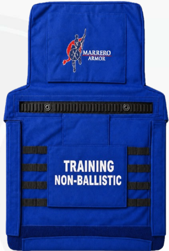
Training Shield (TS) shown with Shield Accessory Mount (SAM) Picatinny Rail