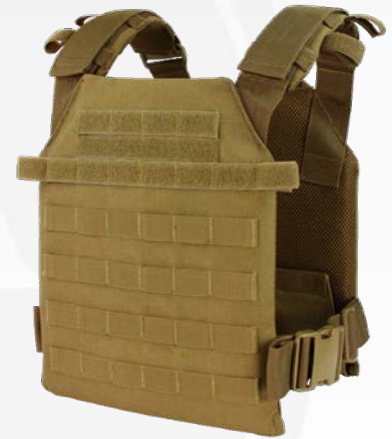
PLATE CARRIER SPECS