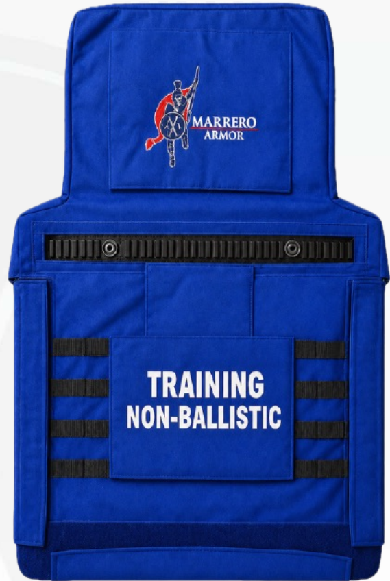
Training Shield (TS) shown with Shield Accessory Mount (SAM) Picatinny Rail