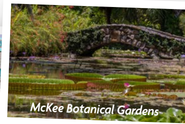
McKee Botanical Gardens