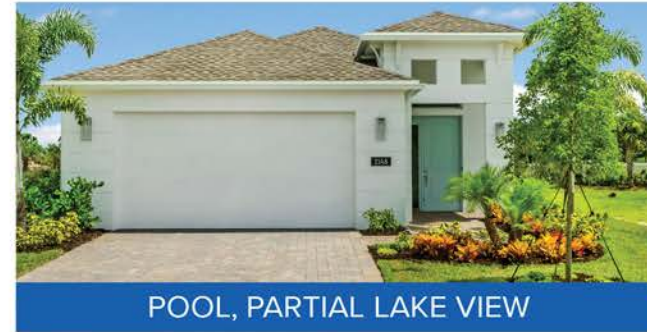
POOL, PARTIAL LAKE VIEW

MOVE-IN-READY OPPORTUNITIES AVAILABLE NOW!