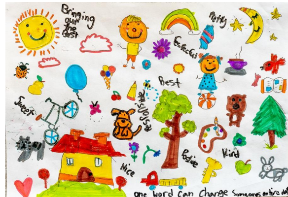
Ellie's winning picture.