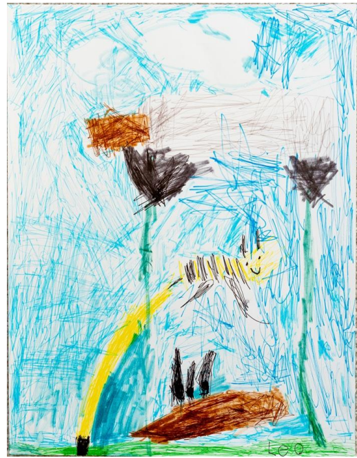
Leo's winning picture