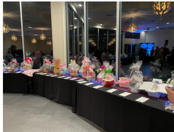
Silent and Live auction items