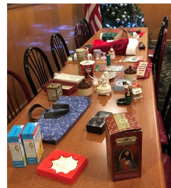
Christmas Gift Table.