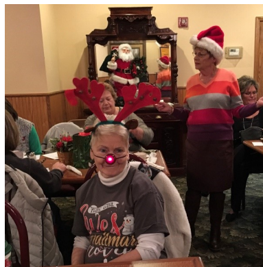
Rudolph and Mrs. Santa Claus led the fellowship.