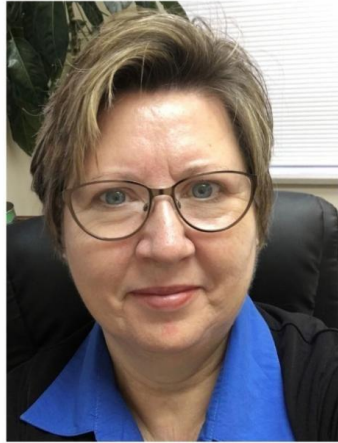
Cynthia R. Cherry CPA, LLC