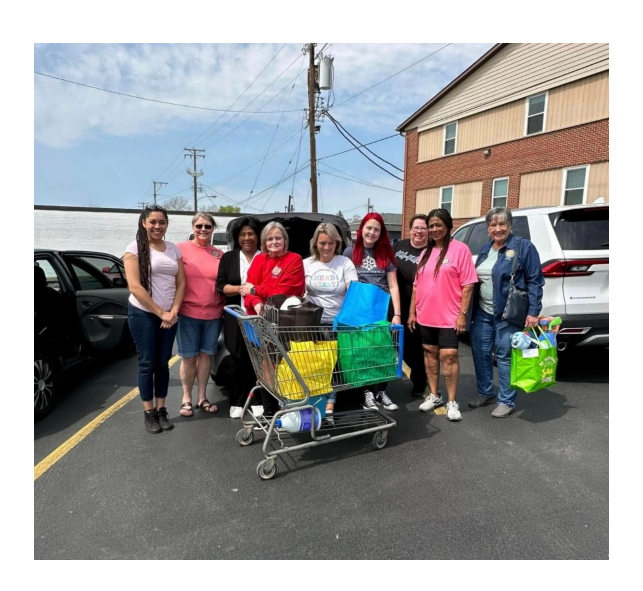
Delivering to Head Start representatives.