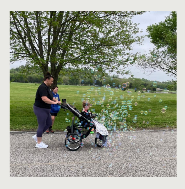
Participants encountered bubble machines along the route.