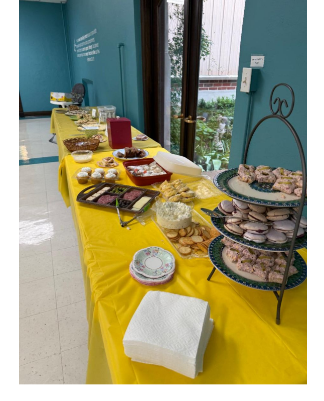
Members and the United Methodist Church provided many delicious treats.

Attendees enjoyed their tea and treats while listening to announcements and socializing