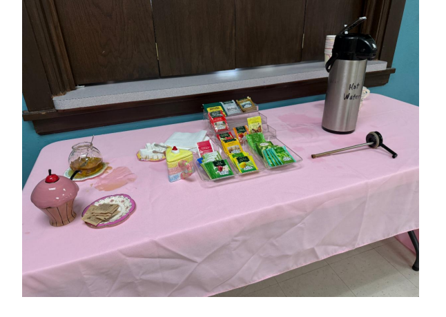
Attendees had a variety of teas to select from.