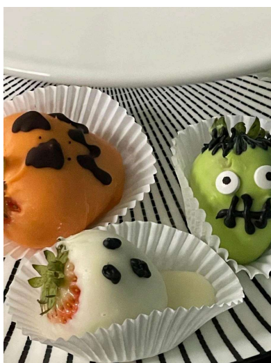
Some of the goodies members brought to snack on!