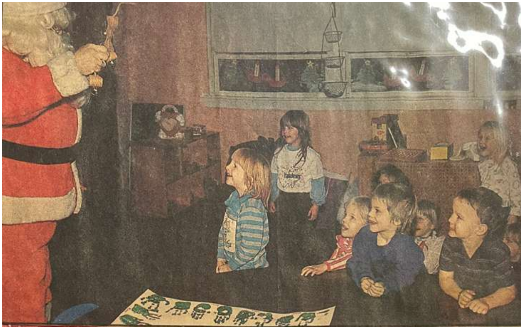
The first Head Start Holiday party, still a favorite project!