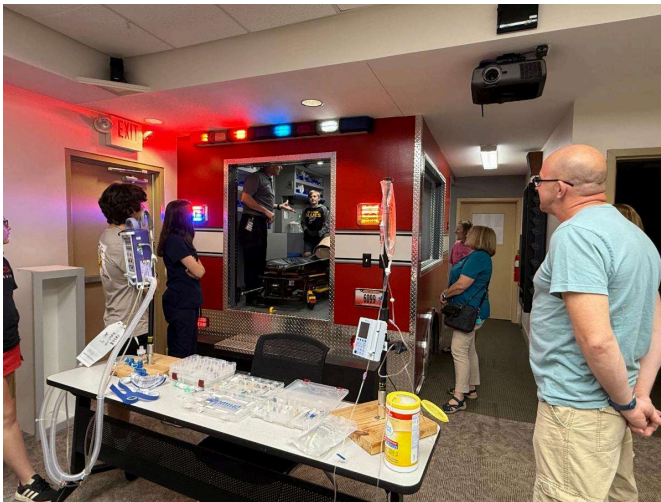
JOI Club members touring the JPAD Ambulance Simulator