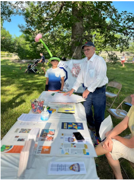
Family Fun Fest June 21