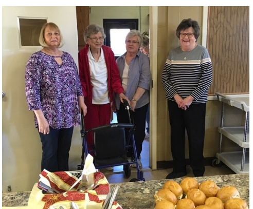
Thank you ladies for a delicious meal.