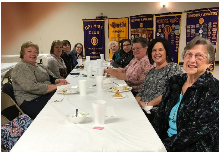
February 19—Members of the club attend the Oratorical Contest at the KC Hall.