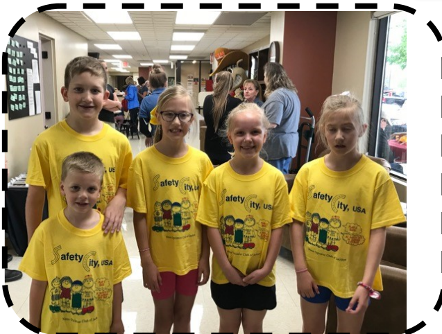
Five children were very happy to receive a Bicycle Safety T-Shirt.