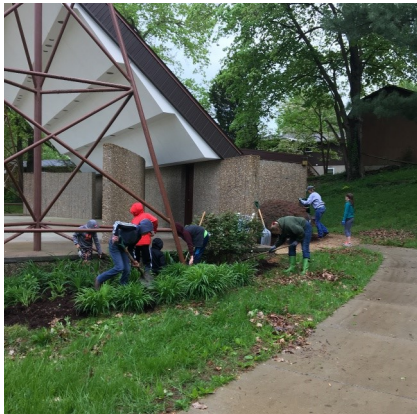
Progressive 4-H Club members help beautify the landscape at the Band Shell.