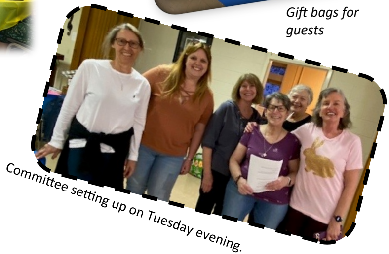
Committee setting up on Tuesday evening.