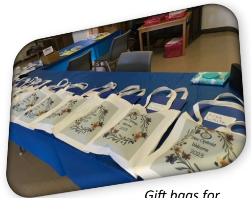
Gift bags for guests