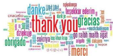
Several donations have been recieved from the mass mailing to the community for sponsorships!