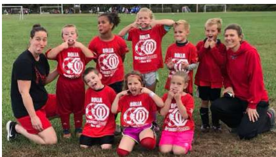
2017 Optimist soccer team with "something in them" for sure!

To make all your friends feel that there is something in them.