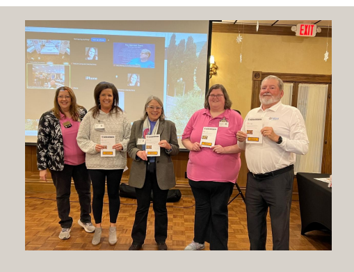
Governor Phyllis recognizes